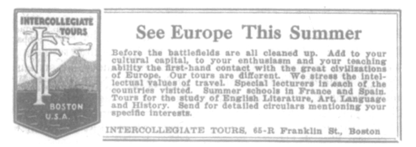
Image 2. See Europe this summer. "See Europe This Summer," Midland Schools 35, no. 6 (February 1921): 196. Note that this advertisement explicitly invited teachers to add to their "cultural capital" by traveling to Europe.

Even more rarefied was the cultural capital gained through European travel. An advertisement for a "Teachers' Excursion" to the Paris Exposition in 1900 claimed it would "be a great opportunity to witness in panoramic display the progress and achievements of the world in the nineteenth century, and a chance to see some interesting things in Europe besides," and an article in The Intelligence 's "Tour and Travel" section in May 1901 noted the large number of teachers participating in summer tours of Europe and offered advice for packing. Ads for travel in Europe proliferated in education journals in the early 1910s and following the Great War. One in 1911 promised an "Ideal tour at a moderate price" to six countries and Paris. An ad for Intercollegiate Tours that appeared in Midland Schools repeatedly in 1921 even invited teachers to "Add to your cultural capital, to your enthusiasm and your teaching ability the first-hand contact with the great civilizations of Europe."<sup>39</sup>