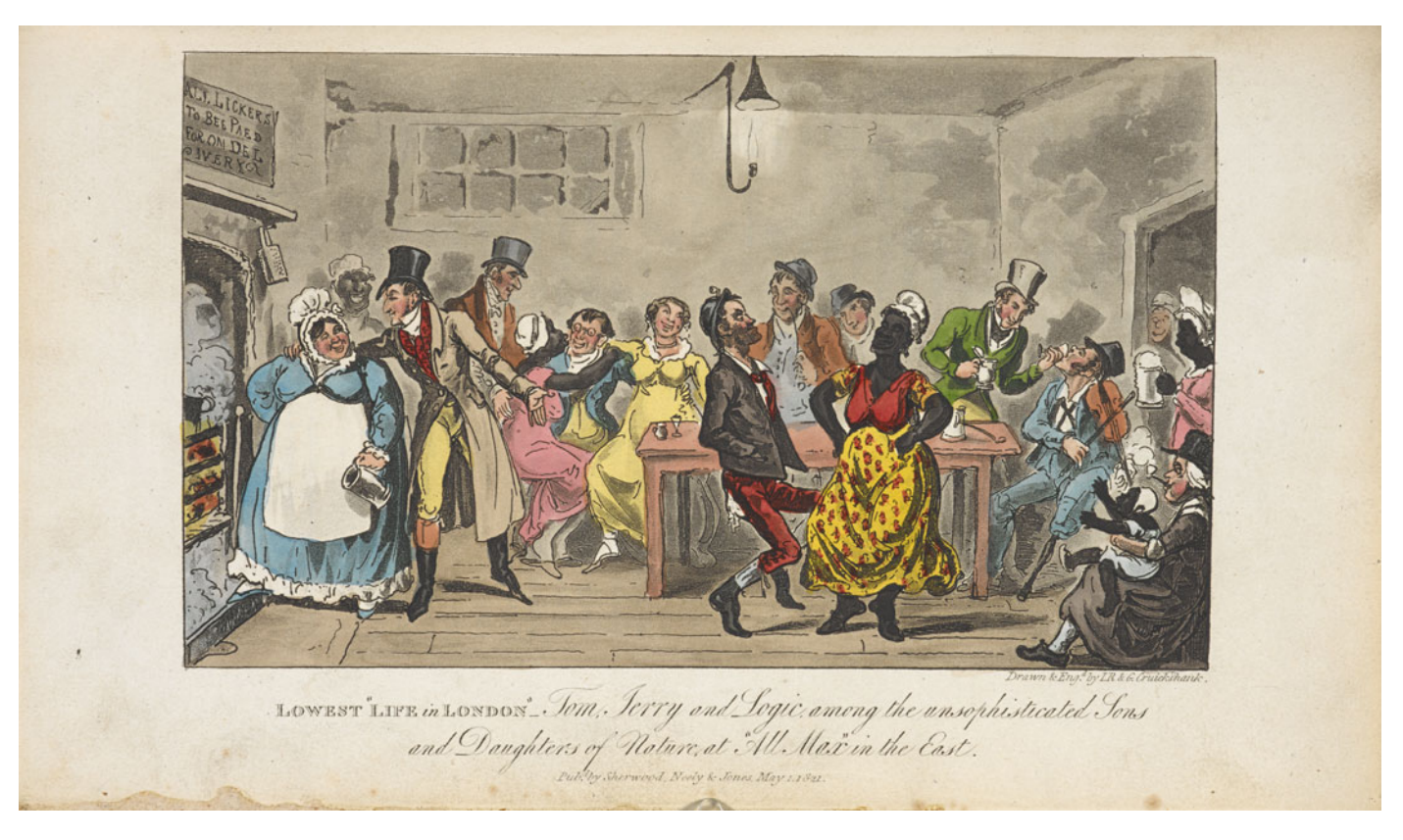
Figure 2. London low life: All Max in the East. I. R. & G. Cruikshank, hand-colored etching and aquatint, 1 May 1821. © The British Library Board 838.i.2, plate opposite p. 286.