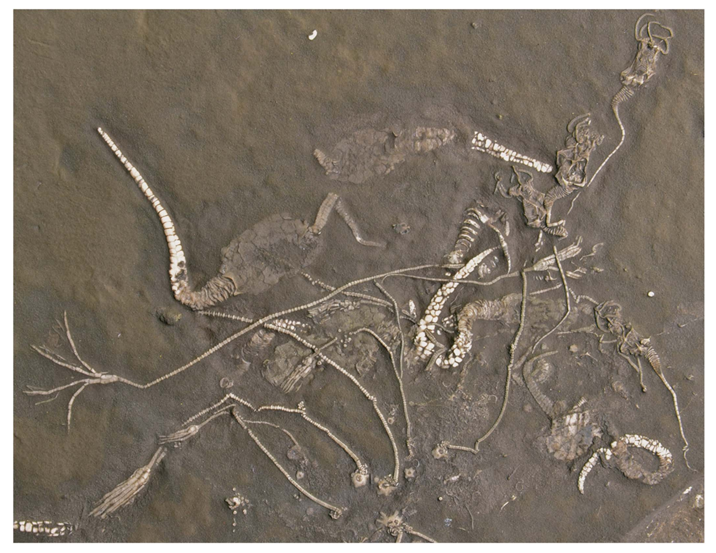
Figure 2. At least ten complete juvenile specimens of Ectenocrinus simplex (Hall, 1847) attached to a hardground within the Upper Ordovician Neuville Formation near Quebéc City in Canada. Jim found that lengthening of the stem follows a logistic pattern, with relatively slow growth in the youngest crinoids, a "middle aged" growth spurt during which stem length increases extremely rapidly, then comparatively slow growth in the adult phase. This growth sequence offers a general model that can be extrapolated to other stalked crinoids in which complete specimens are known but growth sequences are not available. Reconstruction of stem lengths allows for study of how progressively larger and older individuals can position their calices further above the seafloor. This suggests partitioning of space and food resources, a finding augmented also by Jim's work on food-groove widths and tube-foot spacing (e.g., Brower, 2011) (text paraphrased from Jim's contribution to the Dept. of Earth Sciences Alumni Newsletter from 2017).

focused on how morphology of crinoid feeding structures scaled with body size through ontogeny, hypothesizing that the relationship should be governed by an energy balance between nutrients captured and metabolic requirements. The general theme of ontogenetic scaling of crinoid feeding was to remain a focus throughout his career, and his approach continued to evolve, ultimately resulting in models that combined morphological and environmental parameters within the paradigm of filtration theory (Brower, 2007). Characteristic of all these studies is the rich, exceptionally detailed morphometric data, the statistical rigor of analysis, and their grounding in sound biological and biomechanical principles (e.g., Brower, 1987).