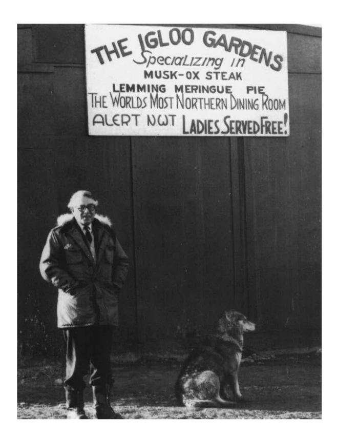
Fig. 1. Lord Shackleton at Alert in 1965.

the rank of Wing Commander, and being twice mentioned in despatches and awarded the OBE.