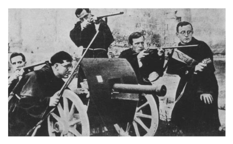
Figure 5. "The 'representatives of God on earth' also take up the arms. In a Catalan village these priests turn against the people." This photograph, published in Solidaridad Obrera , 1 August 1936, by the Comissariat de Propaganda of the Generalitat de Catalunya , was allegedly found in Count Vallellano's house, but probably originates from before 1936.

political culture which had sustained anticlericalism collapsed, and the anti-ecclesiastic mobilizations lost all meaning.<sup>48</sup>