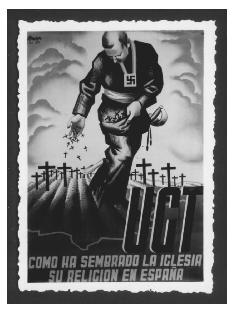
Figure 6. "How the church has sown its religion in Spain"; poster from the Unión General de Trabajadores (UGT), c. 1937, designed by Raga. International Institute of Social History, Amsterdam

generalization of social movements. <sup>50</sup> Spanish anticlericalism in the nineteenth and twentieth centuries is a perfect example of this thesis. As we have already seen, the anticlerical outbursts took place in situations of