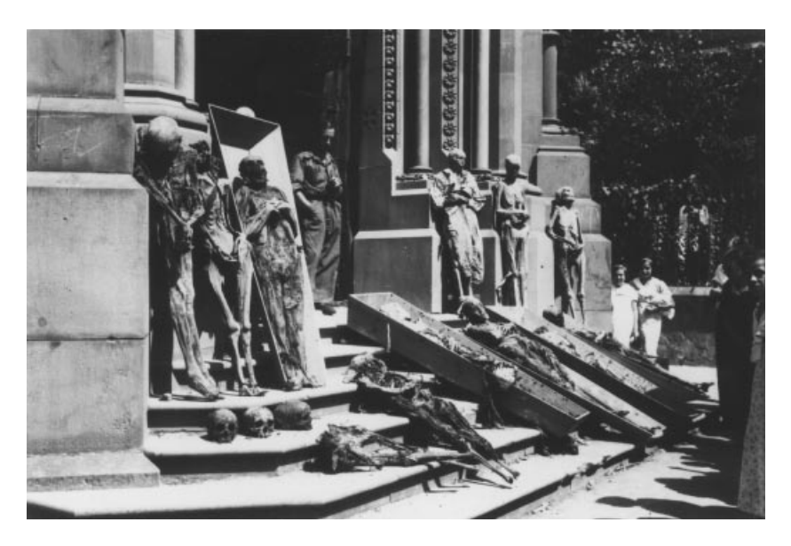
Figure 1. Display of exhumed bodies of monks or nuns, Barcelona, 1936. CNT Collection, International Institute of Social History, Amsterdam

chosen to consider these violent acts as the result of the fanaticism and irrationality of the popular masses: the action – referred to by an official publication of the republican camp during the Civil War – of "unbridled and uncontrolled crowds, who wildly wield their fury against their enemies", or of a people which "having shattered all moral restraints, becomes a dangerous beast which steals, burns, and kills". We could give numerous examples, but in the end the same image always appears: of bloodthirsty, uncontrollable, fanatical and irrational mobs running wild.