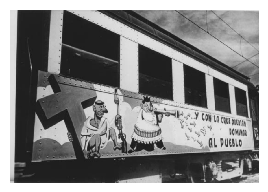
Figure 3. "The Sindicato de Dibujantes y Pintores (the union of draftsmen and painters) from Barcelona has formed teams, which decorate trains with splendid inscriptions and antifascist allegories". The slogan on the train reads: "and with the Cross they wanted to control the people".