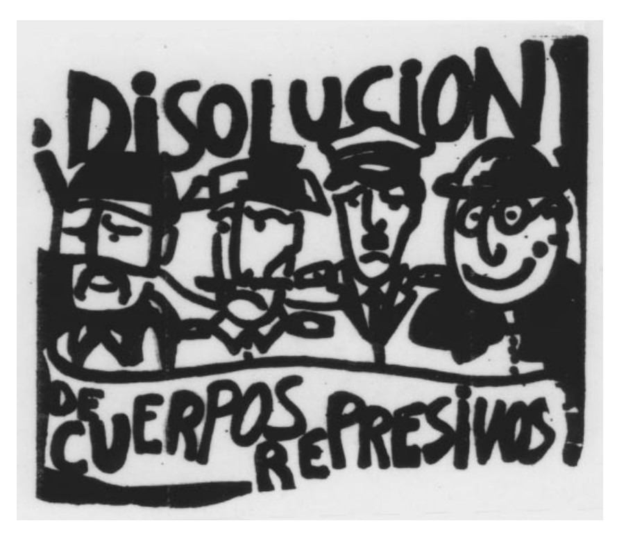
Figure 7. "Dissolution of repressive bodies"; sticker, probably from 1976.

civil or external war, of revolution or, at least, of radical political change. In these circumstances, the old attitudes of opposition to the clergy that the liberal, republican, or libertarian press and freethinking or anticlerical newspapers had kept alive, were given fresh impetus, and even became integrated in a new cultural framework, a political culture in which violence was considered by the different adversaries to be a legitimate form of action. The violent acts against the clergy which occurred on these occasions, but not outside them, cannot, consequently, be considered as just another reflection of the violent traditions of Spanish culture, comparable with the mistreatment of animals in popular festivities, nor as a simple response to the pressures of religious ritualism or sexual repression. The violence was related more to the consideration of ecclesiastic institutions as enemies of freedom of conscience, this idea having spread during the nineteenth century throughout most European countries except Spain, and, more generally, as enemies of what was