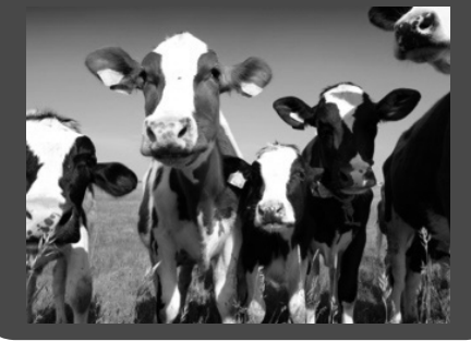
And special symposium: What have "omics" contributed to our understating of cow fertility?

Uterine infection Dry cow nutrition Breeding soundness examination of the Bull Synchronisation and ovulation control regimens Superovulation and embryo transfer