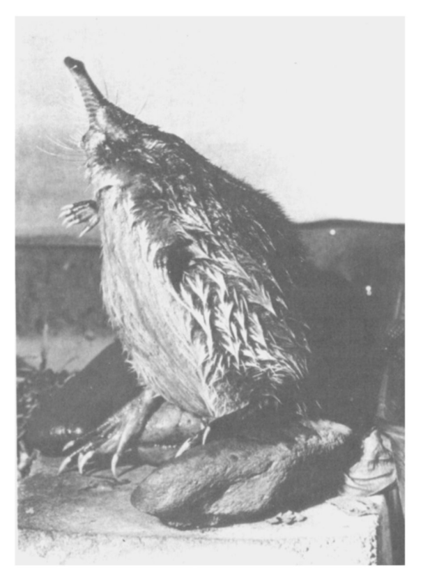
The Pyrenean desman Galemys pyrenaicus.