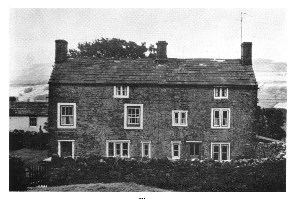
Fig. 1 Hillary Hall, home of the Hillary family in Burtersett, Wensleydale