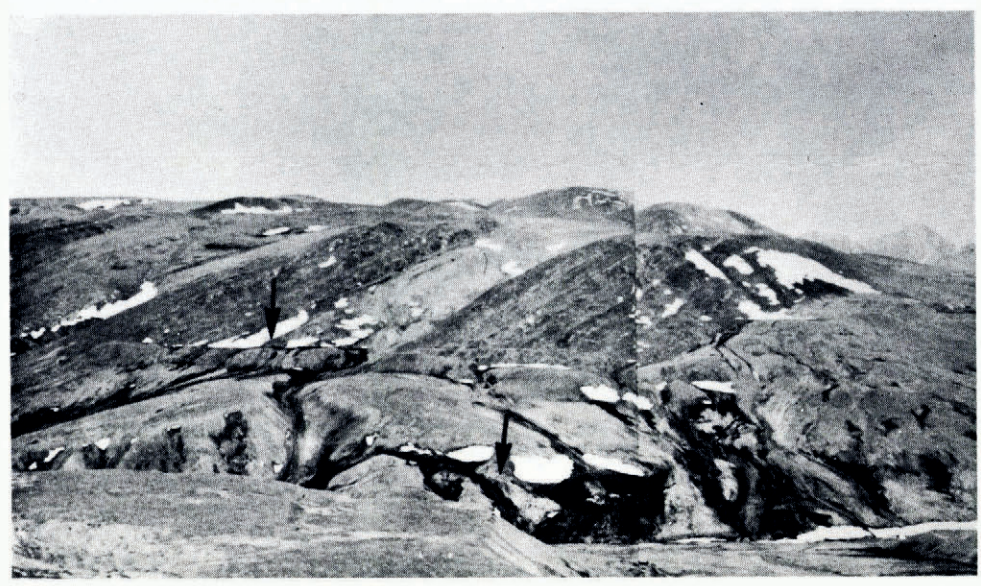
Fig. 3. View looking southward across upper "Beethoven Valley" showing segment of horizontal ice-shelf moraines (c. 200 m a.s.l.) and the steeply sloping lateral moraines extending into the interior of Judge Daly Promontory (c. 260 m a.s.l., right background). Note slight depression in the moraines at the contact with the former ice shelf. Associated pro-glacial marine terraces occur down-slope from ice-shelf moraines. Locations of dated shell samples are shown by black arrows.

these moraines on the south-west side of "Beethoven Valley" are shown in Figures 2 and 3, respectively. The slope of the moraines shown in Figure 3 compares with observations made on the Ross Ice Shelf, Antarctica, whose profile is characterized by "(i) the abrupt increase in elevation as one goes from the ice shelf on to the continental ice sheet and (ii) the depression associated with the juncture of the ice shelf and ice sheet" (Theil and Ostenso, 1961, p. 825). Several altimeter transects, corrected for both temperature and pressure, were run along the entire horizontal sector of the "Beethoven Valley" moraines and no elevation differences >1 m were detected. Similar, but less extensive, lateral moraines occur on the opposite side of the valley and suggest an ice-shelf width of c. 2 km.