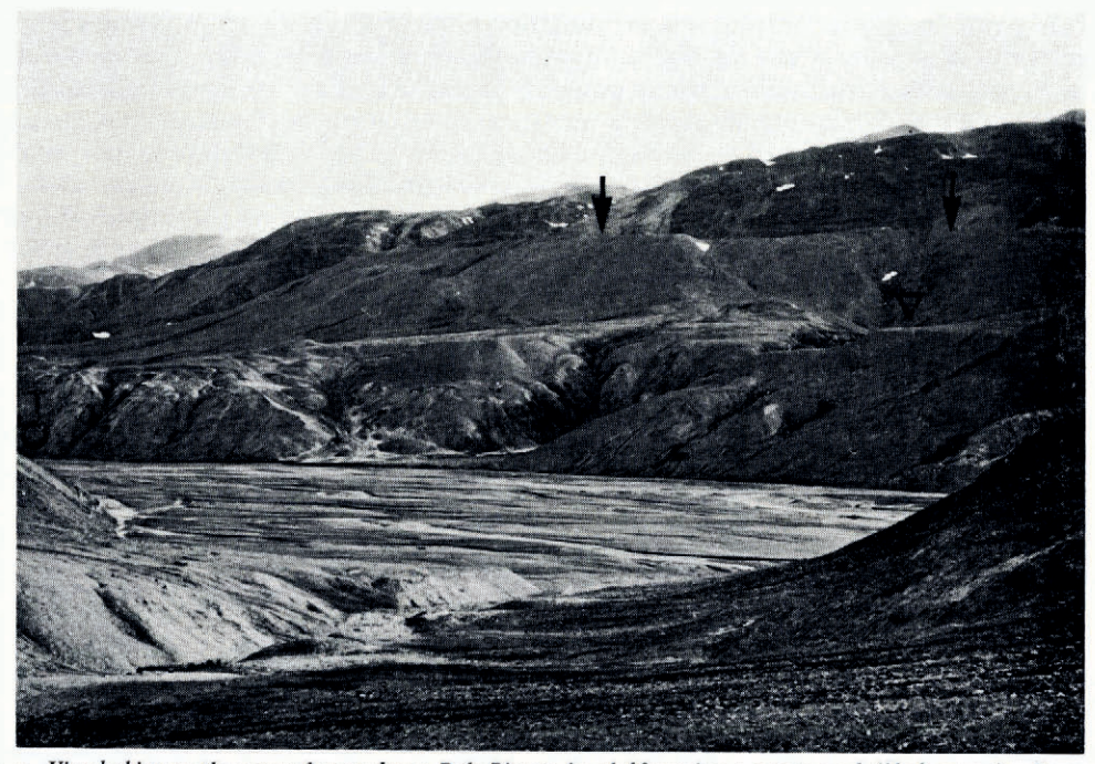
Fig. 4. View looking south-westward across lower Daly River to ice-shelf moraines c. 195 m a.s.l. (black arrows). Down-slope is a 50 m thick section composed of fossiliferous till (T) overlying bedded sands containing organic debris (open circle). Superimposed over this section are terraces at c. 105 m a.s.l. which appear to be equivalent to the pro-glacial terrace downvalley dated 27 950±5 400 B.P. (St. 4325). Site of amino-acid age estimate (>35 000 B.P.) is shown by open triangle.