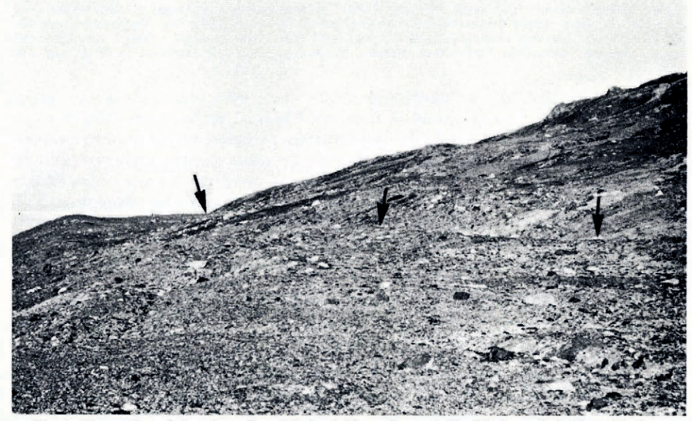
Fig. 5. View looking southward along the surface of the ice-shelf moraine, west side of the lower Daly River. Black arrows point to break in slope where one enters weathered bedrock and sparse Greenland erratics.

Fig. 4. View looking south-westward across lower Daly River to ice-shelf moraines c. 195 m a.s.l. (black arrows). Down-slope is a 50 m thick section composed of fossiliferous till (T) overlying bedded sands containing organic debris (open circle). Superimposed over this section are terraces at c. 105 m a.s.l. which appear to be equivalent to the pro-glacial terrace downvalley dated 27 950±5 400 B.P. (St. 4325). Site of amino-acid age estimate (>35 000 B.P.) is shown by open triangle.