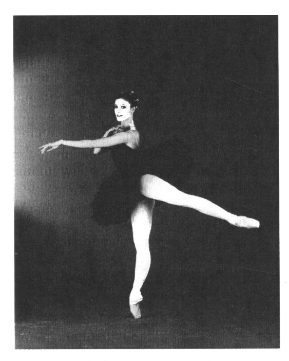
Figure 2. Karen Kain in Swan Lake (1977).

while his partner needs steadying and is led, handled, and manipulated. Daly concluded that women could not represent themselves on the classical ballet stage as long as they were unstable on the tips of their toes, and as long as they had to be as superlatively strong but were not allowed to exhibit that strength in a recognizable way and receive the respect that obvious power accrues in contemporary society (1987/88, 17). Critiques from other dance writers pointed to the training process that produces the ballerina as inevitably damaging, both physically and psychologically. 10