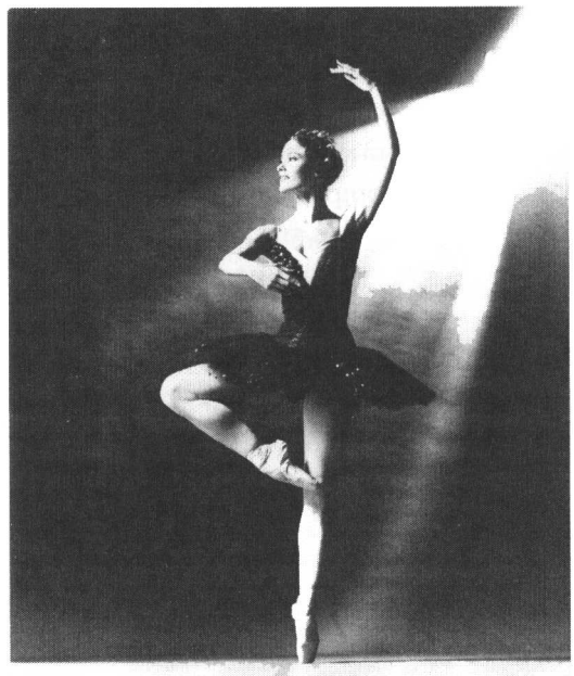
Figure 3. Karen Kain in Swan Lake (1975).