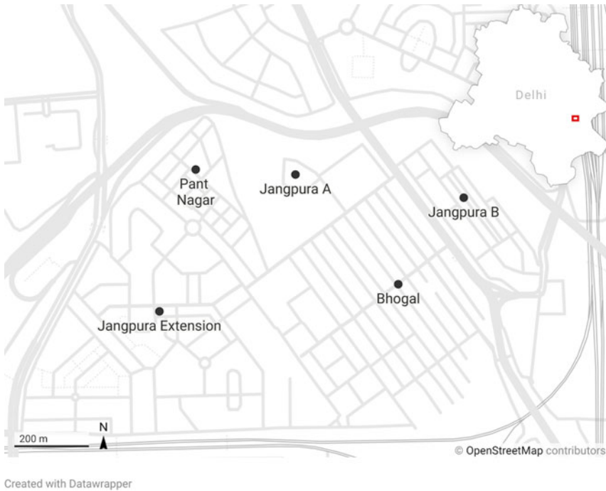
Figure 1. Map of Jangpura-Bhogal and its location in Delhi. (Note: The map is not an accurate representation and is for illustrative purposes only.)

settlements. It is primarily a middle-class area with dispersed slum populations, comprising the contiguous localities of Bhogal, Jangpura-A, Jangpura Extension, Pant Nagar, and Jangpura-B, with a main urban street, Mathura Road, bifurcating the settlement (see Figure 1). The Barapulla nala (drain) separates it from the Muslim-majority neighbourhoods of Nizamuddin Basti and Nizamuddin West. Forming a part of the South East Delhi administrative division, Jangpura-Bhogal is included in the Delhi Legislative Assembly constituencies of Jangpura and Kasturba Nagar. 14