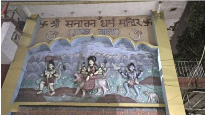
Figure 3. Entrance to the Temple Complex.

of neighbourhood, and well-connected figures like Goswami Girdhari Lal. 40 My conversations with the widow's son, relatives, and other residents enrich the details of this story of how the newly arrived majority-Hindu residents of Pant Nagar in the 1950s encountered a large dilapidated Muslim tomb with an unmarked grave. An elderly homeless man sought shelter there and used coal to draw figures of the Hindu god Hanuman on one of the walls, dying soon after.