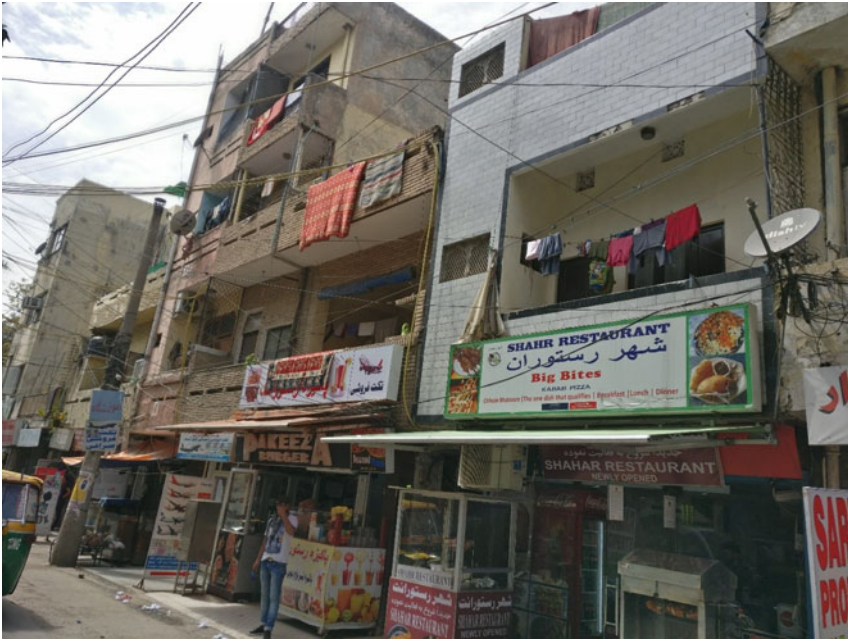
Figure 4. Afghan restaurants on Central Road, Bhogal.

memory, and their past is displaced from representations and recollections of the neighbourhood's diverse history.