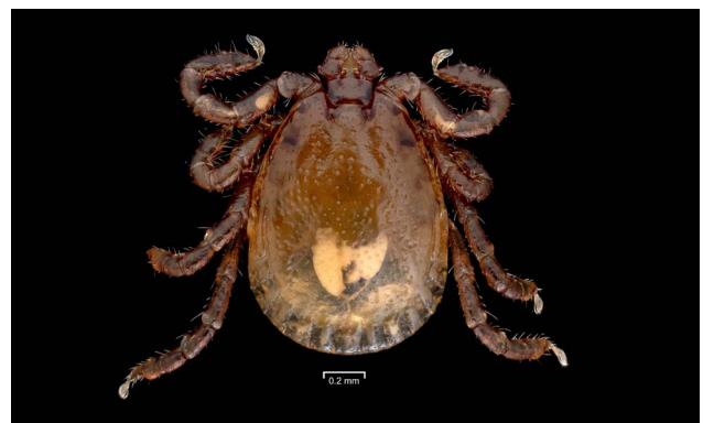
Adult male Ryukyu rabbit tick Haemaphysalis pentalagi .

An ex situ insurance population of H. pentalagi has been established at Hokkaido University from individuals collected on Amamioshima. This population has successfully reproduced in captivity and had completed one full life cycle as of May 2024, with the second captive-bred generation now maturing. A husbandry manual for this