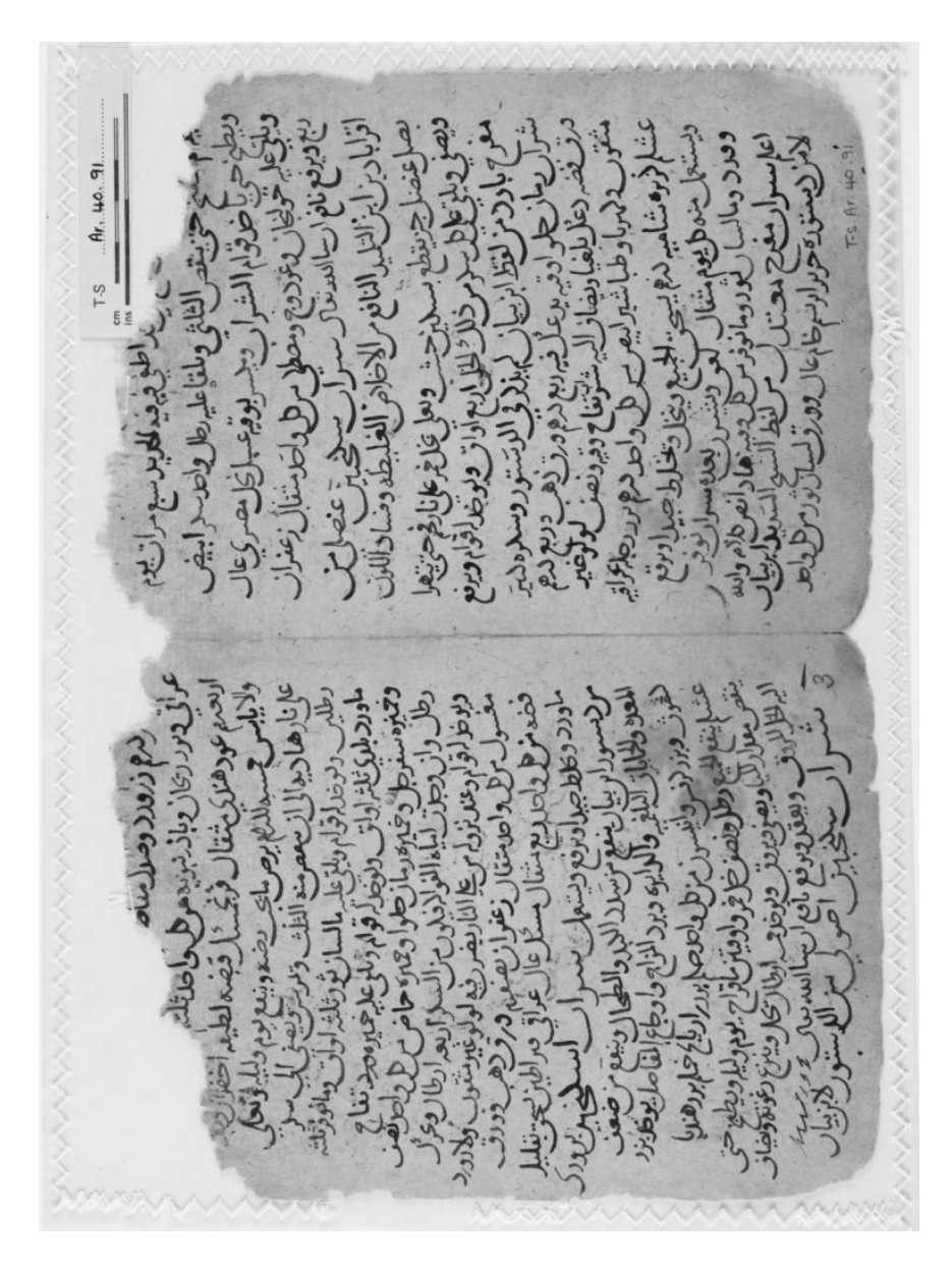
Figure 1: A page from Abū al-Munā al-Kūhīn al-'Aṭṭar's Minhāj al-dukkān fī al-adwiya al-nāfī'a lil-insān (The Shop Guide, or, How to run the [Apothecary's] Shop), found in the Genizah (T-S Ar.40.91).