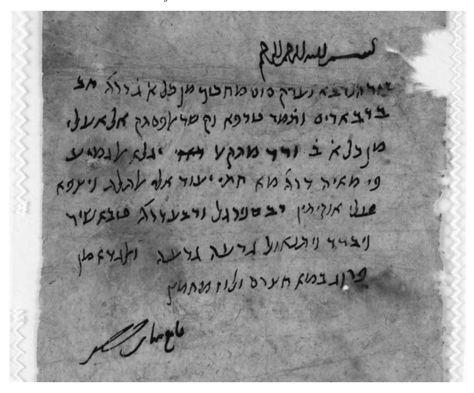
Figure 3: Prescription for a recipe written in Judaeo-Arabic, opening and closing with benedictions in Arabic (T-S Ar.30.305).

were found in the Taylor-Schechter Genizah Collection; of these, 40 were more or less complete. A few more were discovered in other collections. In most cases these are written in Arabic script (92) and Arabic written in Hebrew script (Judaeo-Arabic) (47), the most widely used languages and dialects in the daily life of medieval Cairo. Very rarely Hebrew (1) or Judaeo-Persian (1) is found. In a few cases the prescription is written in Judaeo-Arabic but the benedictions that open and close it are written in Arabic script (see Figure 3). In one case, the same formula is written in Judaeo-Arabic on one side of the sheet and in Arabic on the other. In another, two similar versions of the same formula, written in Arabic and headed ma'j\bar{u}n hibat all\bar{u}h , are found on the same side of a fragment. The handwriting is usually sloppy and unclear. A few prescriptions were copied identically, others with changes, from famous books such as Minh\bar{u}j al-dukk\bar{u}n or Dust\bar{u}r al-B\bar{u}m\bar{u}ristan\bar{u} . Most of these prescriptions were written on one page, usually on one side