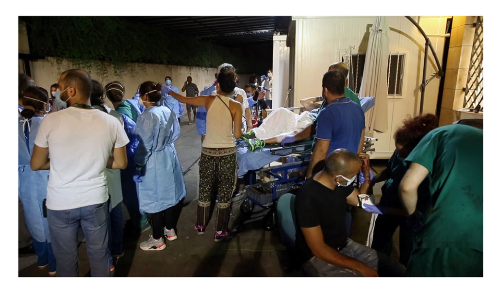
Figure 1. The parking area of the emergency department.

on the hospital premises, and 2 others who lived within a walking distance to the hospital arrived within a minute. After the staff realized that the explosion originated somewhere outside the hospital and the influx of casualties started, the disaster code was activated from the operator. A message via the mobile instant messaging platform WhatsApp Messenger (https://www.whatsapp.com/) was sent by the CMO to all physicians to come to help at the hospital. Less than 30 minutes later, the ED was filled with casualties lying on beds, on the floor, in the corridor, outside the ED, and near the elevator; later, in the parking area, the ground was a bloody scene (Figures 1 and 2).