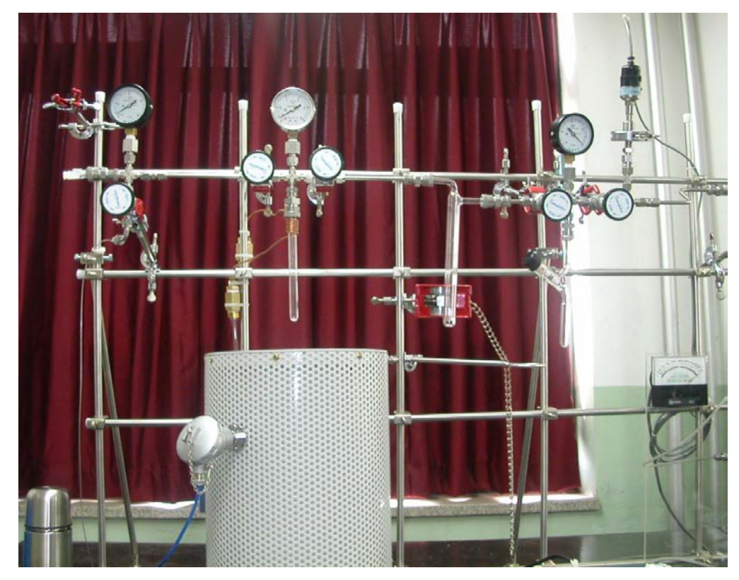
Figure 2 Photograph of the present combustion system for liquid and gas samples