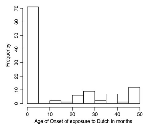
Fig. 1. Distribution of AoO of exposure to Dutch in months.

errors with noun plurals were made with the most irregular items: 95% (411/430) of the errors with noun plurals were made with items in class 3 (NP3). In those cases, children did not apply lengthening of the stem vowel. Of the errors with a suffix, 32% (10/31) were cases of suffix omission, and 68% (21/31) were cases of a wrong suffix. 'Other' refers to children either responding with "I do not know" or using a different word.