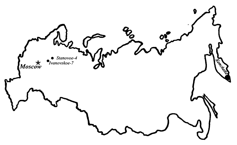
Figure 1 Key areas on the map of Russia