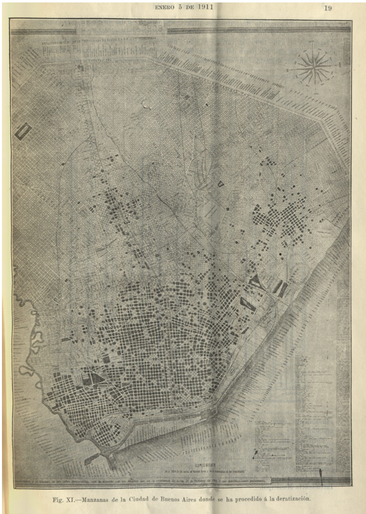
Figure 2: Map of the progress of deratization campaigns in Buenos Aires. Source: Pedro Rivero, 'Saneamiento de La Ciudad Buenos Aires. Deratizacion', La Semana Medica , 18, 1 (1911), 19. Courtesy of the New York Academy of Medicine Library.