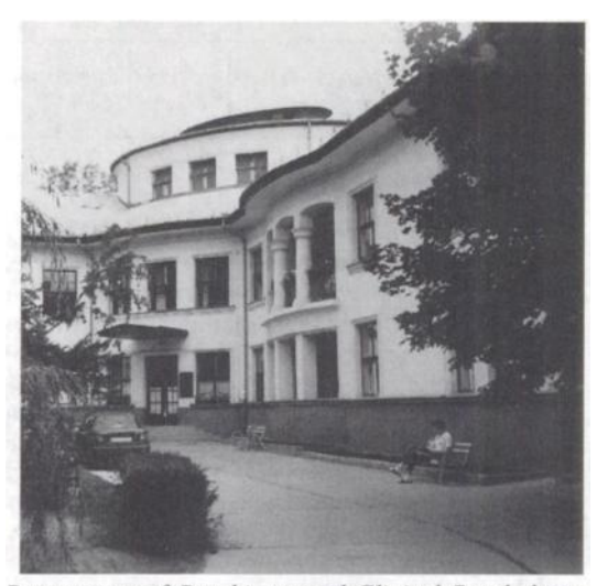
Department of Psychiatry and Clinical Psychology, Postgraduate Medical University, Budapest.

*Presented in part at the Regional Symposium of the World Psychiatric Association in Banff, Alberta, Canada, January 1993.