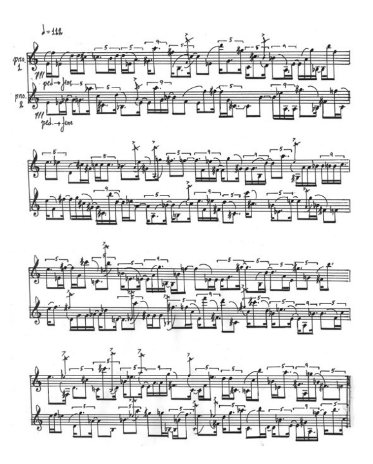
Example 3: Bryn Harrison, Towards a slowing of the past , pages 1–2.

recorded sample) is sometimes omitted or, in other instances, only the crescendo from the reversed fade is heard. This further disrupts the predictability of events and thwarts expectation and is explored still further in the middle of the piece, when a single sampled piano chord appears, electronically manipulated by Mark Knoop so that it stretches out ad infinitum. The chord emerges from the resonant decay of the live material that has been left to ring and gradually swells to a volume which matches that of the previously performed passage. The chord is then sustained within an undifferentiated space for two minutes. Just as the backwards samples would be impossible to render live, this chord feels heavily manipulated, a synthetic texture reminiscent of a string pad stretched in time. The harmonic field at first seems devoid of movement and its stillness is in marked contrast to the previous contrapuntal passage. After about half a minute one begins to detect slight pulsations within the sustain-tone texture, a noticeable ebb and flow, small oscillations or slow beating patterns within the sound spectrum. I remember, during the premiere of the piece, being carried along with these slight changes, drawn to the circularity of its rhythm, this subtle pulsation that results from incremental beating patterns emerging from an acoustic field.