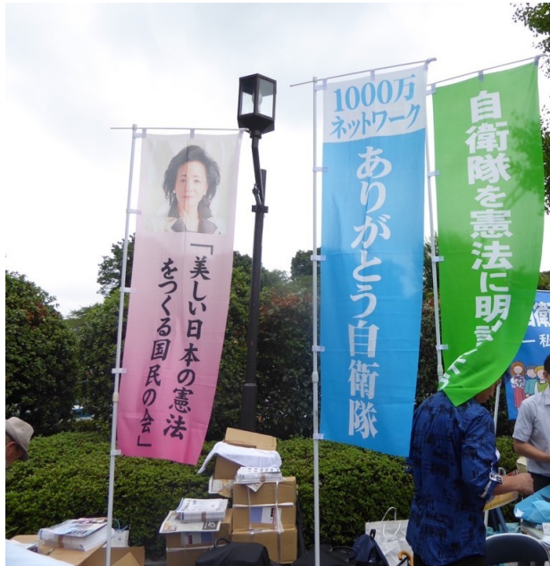
The flags at the booth of the Association to Create a Beautiful Constitution for Japan in front of Yasukuni Shrine on August 15, 2017.

The flyer “Thank you, SDF” by the National Citizens’ Association to Create a Beautiful Constitution for Japan.