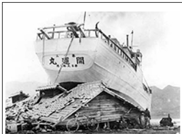
It took nearly 24 hours for tsunami waves created by the Chilean earthquake of 1960 to reach the Japanese coast.

e360: It originated in roughly the same area as the recent tsunami?