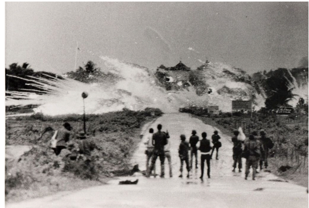
Trang Bang, Vietnam, 8 June 1972

If the doctrine of strategic bombing has been the object of much attention in the military history and international relations literature (Biddle 2002, Pape 2011), few studies have focused on the means deployed to achieve the bombings. Yet, these means are crucial to understand three decisive aspects of the doctrine and practice of strategic bombing: (1) how they have been defined; (2) how they have changed; and (3) how they have been perceived and used by different actors (militaries, international institutions and public opinion) over time (3). This article highlights these issues through the analysis of napalm utilization by the US military. It demonstrates that the massive use of this weapon, from its creation in 1942 to the Vietnam War, is at the core of a shift in the doctrine and practice of American strategic bombing. The article demonstrates that analysis of the weapons deployed for 'strategic bombing' enriches the historiography - and the understanding - of the doctrine and practice of strategic bombing itself.