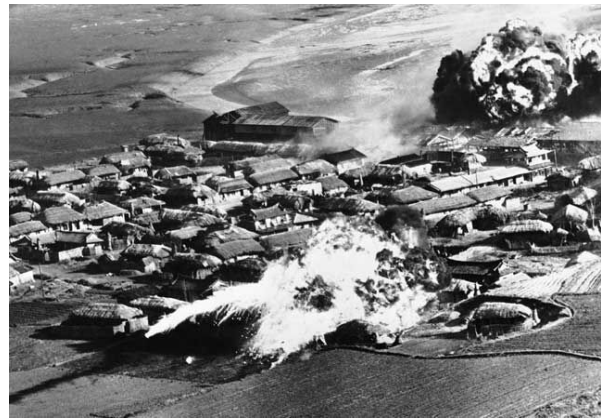
Bombing of village near Hanchon, North Korea, 10 May 1951.

delivered in such large quantities from the very first day, 26 June 1950, to the extent that the New York Herald Tribune provided this provocative headline in October 1950: "Napalm the No. 1 Weapon in Korea". 11 As the Stockholm International Peace Research Institute reported, "a total of 32,357 tons of napalm fell on Korea, about double that dropped on Japan in 1945. Not only did the allies drop more bombs on Korea than in the Pacific theater during WWII - 635,000 tons versus 503,000 tons - more of what fell was napalm, in both absolute and relative terms." 12 At this time, napalm was regarded as a very efficient weapon to achieve area or strategic bombing, that is bombing which not only targeted a tactical infrastructure or position but covered the whole area surrounding the target.