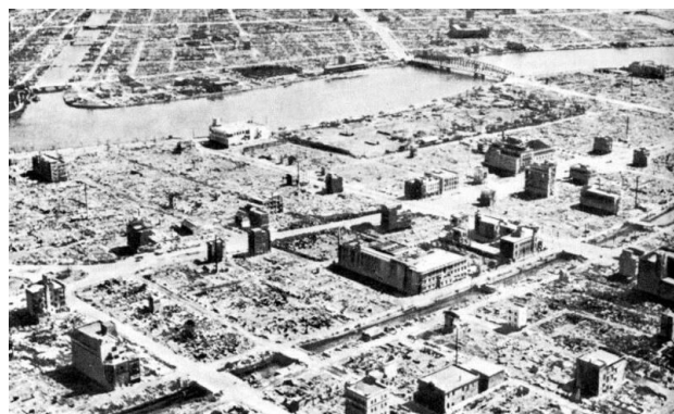
Firebombing of Tokyo, 1945