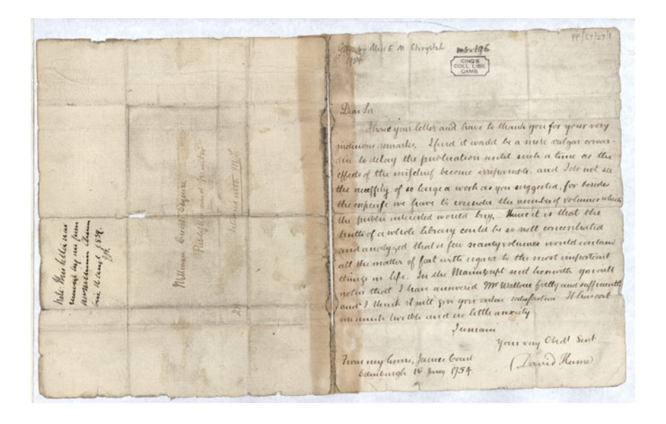
Figure 2—A forged letter, dated 16 January 1754, attributed to Hume. JMK/PP/87/27/1, King's College Archive Centre, Cambridge.

known date of Hume's move to James Court, Edinburgh, by eight years.<sup>33</sup> Notwith-standing these difficulties, Mossner concluded that the manuscript was authentic: the signature resembled Hume's; the direction to William Creech, supposedly in a different hand from the remainder of the letter, was merely the interpolated guesswork of a later collector; and the address, "James Court," agreed with the dating and address in two sets of manuscript memoranda attributed to Hume, in the Huntington Library and the National Library of Scotland (figure 3).<sup>34</sup> Mossner was convinced that Hume's letter had actually been addressed to Andrew Millar (1705–68), Hume's publisher, and transcribed "in the hand of a clerk"—a practice that Hume had never otherwise adopted.<sup>35</sup>