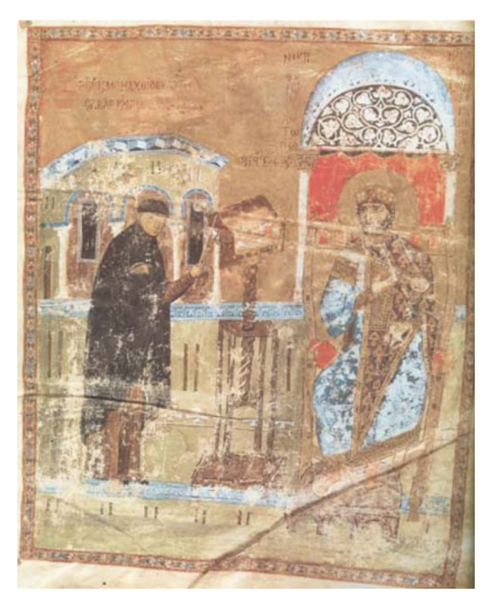
Fig. 3. (Colour online) Paris, Bibliothèque nationale de France, Coislin 79 ( Homilies of St. John Chrysostom ), fol. 1(2bis)r. Nikephoros III Botaneiates receiving religious instruction by the monk Sabbas. 1071–81.

the difference in their status, one being an ancient sage, the other a living Byzantine notable.<sup>89</sup>