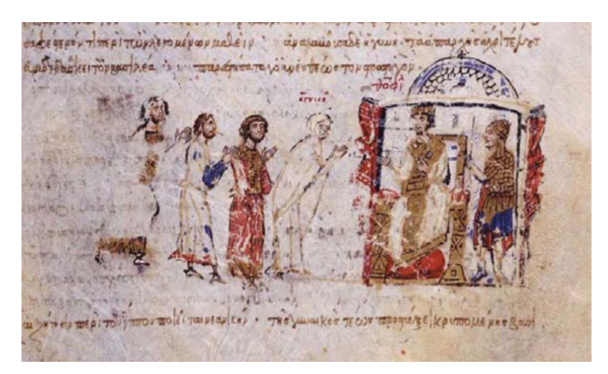
Fig. 2. (Colour online) Madrid, Biblioteca Nacional de España, MS Vitr. 26-2 ( Madrid Skylitzes ), fol. 46r.b. Theophilos and the soldier's widow. Middle of 12th century

gradual, versus the sudden, and the partial, versus the full revelation of that which was concealed behind the curtain.<sup>26</sup>