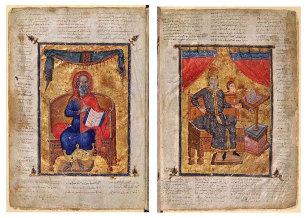
Fig. 4a-b. (Colour online) Paris, Bibliothèque nationale de France, Par. gr. 2144 (Works of Hippocrates), fols. 10v-11r. Hippocrates (left) and the megas doux Alexios Apokaukos (right). 1341–45.

introduced into the portrayal of saintly figures in certain manuscripts associated with the so-called Macedonian Renaissance, but was apparently abandoned soon after.<sup>91</sup> On the other hand, the juxtaposition of an enthroned figure of secular authority revealed by a pair of curtains and the figure of an author, saintly or otherwise, beneath the aulaeum occurs in a group of Carolingian manuscripts.<sup>92</sup> Whether the Byzantine example and the much earlier western ones hark back to a common late antique prototype I cannot say. What one could claim is that the scheme adopted in the Byzantine manuscript is an archaizing one, probably intentionally so as a means for displaying Apokaukos' erudition and culture despite his humble origins, the latter often criticised by his opponents. In the verses that are addressed to Apokaukos as if from the mouth of Hippocrates, he is described as a brilliantly accomplished and successful man and it is thus, I would