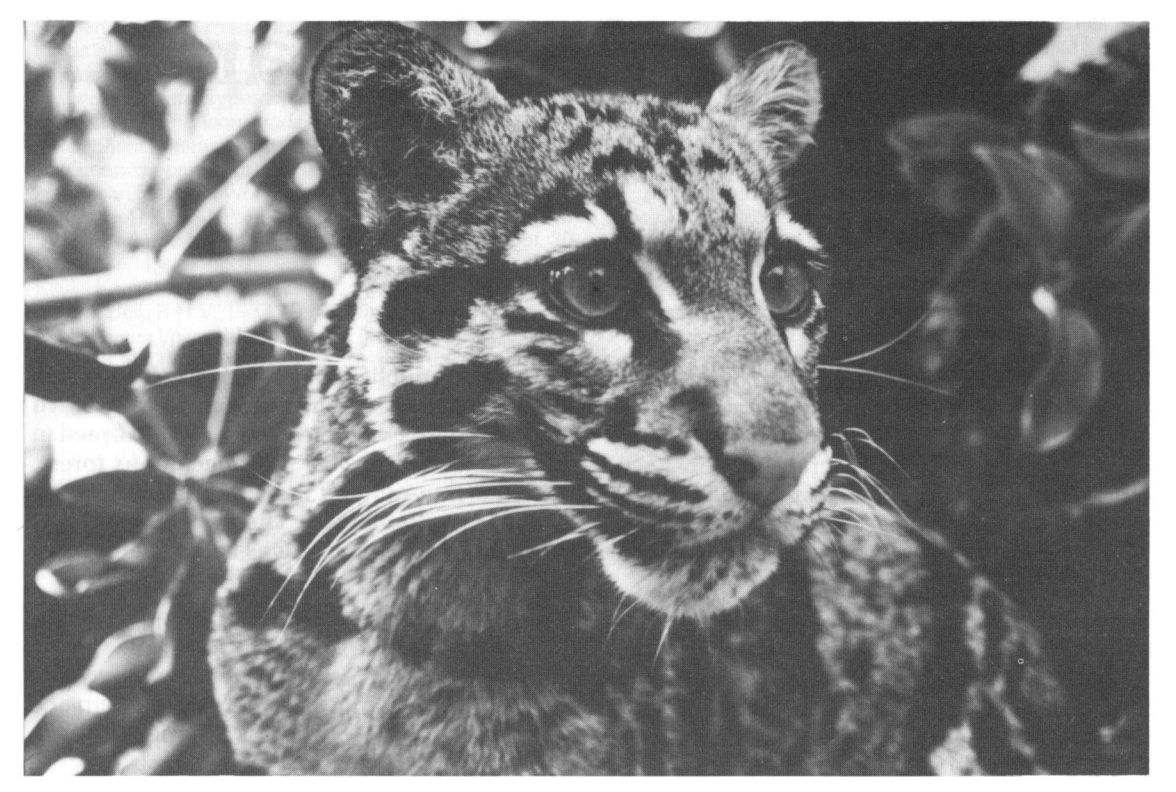
Clouded leopard (Lori Price).

individual, also a male, was stoned to death near the city of Pokhara near the Panchayat Training Centre, retrieved by forestry officials, and placed in the local museum.