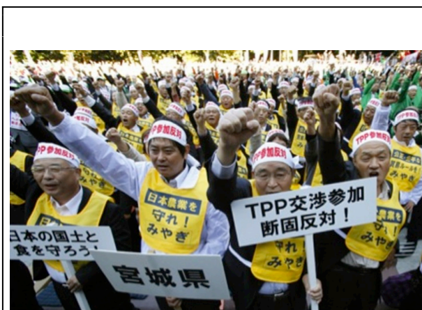
Miyagi farmers in 2011 demonstration in Tokyo: Protect Japanese agriculture

In the 21 st century, one would expect trade negotiators to try to do better than striking down an established system, even one with serious flaws, in the absence of effective protections. The TPP, if it is to be at all acceptable, should do better than the WTO on a range of issues from environmental protection to limits on corporate abuses. Critics of WTO note that it is on record as challenging domestic laws that would bar dolphin meat in tuna products, complicate protecting sea turtles from getting killed in shrimpers' nets, and make it difficult to impose higher pollution control standards on imported gasoline. The general public, of course, if given a say, would strongly urge trade negotiators to improve such a system that came out of complex global negotiations over 20 years ago. Other controversial WTO cases have involved trade in timber logged from tropical forests and attempts to ban imports of meat from cattle treated with growth hormones. There is also one case in which a country was able to keep its domestic ban on asbestos, which an asbestos exporting country had tried to strike down. If the WTO offered at best weak environmental protection, all signs point to the TPP as watering down even these minimal restraints. [ Citizen Trade - WTO & Environment ] 5