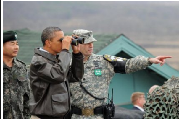
Fig. 1. Obama Peers into North Korea from What He Calls “Freedom’s Frontier” on March 25, 2012.

Korea’s consolidation as a state, registers little, if at all, within the United States where the Korean War is tellingly referred to as “the Forgotten War.” Indeed, few in the United States realize that this war is not over, whereas no one in North Korea can forget it.