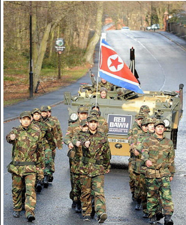
Fig. 4. The Chinese North Koreans Have Invaded. Still from Red Dawn 2 (2012) in which the original PRC flag was digitally altered to appear as a DPRK flag.

billion dollars in the year of Red Dawn 2 's release—announced it had decided, at the eleventh hour, to replace the film's Chinese bad guys with North Korean villains. North Korea, of little significance as an open consumer market in today's global entertainment industry, could be pasted in as China's proxy, with few financial consequences. Digitally altering PRC flags, military insignia, and propaganda posters to appear "North Korean" would cost the studio well over a million dollars in the post-production phase. Although Obama's policy toward North Korea has officially been one his advisers dub "strategic patience," or non-engagement, North Korea has served as a cornerstone in this administration's interventionist approach toward the Asia-Pacific region. Although an expanded American military role in the region, including a "rebalancing" of U.S. naval forces to 60% (in contrast to 40% in the Atlantic), may be aimed at containing a rising China, the growing U.S. regional military presence, under Obama's "pivot" policy, has been overtly justified by the specter of a nuclear-armed, volatile North Korea.