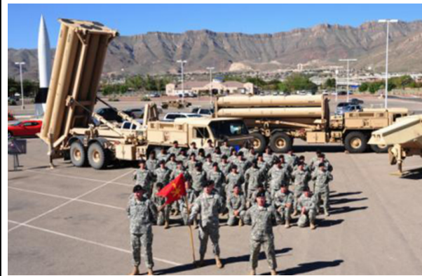
Fig. 5. Red Dawn 2 Redux? Lockheed Martin product page for Terminal High Altitude Area Defense (THAAD).

trigger-happy North Korea has justified the acceleration of the THAAD missile-defense system in Guam, a second U.S. missile defense radar deployed near Kyoto, Japan, the positioning of nuclear aircraft carriers throughout the Pacific, and lucrative sales of military weapons systems to U.S. client-states through the Asia-Pacific region. Albeit all key elements in U.S. first-strike attack planning, this amplified militarization of the “American Lake” is justified by the Pentagon as a “precautionary move to strengthen our regional defense posture against the North Korean regional ballistic missile threat.” 24 As early as June 2009, then-Secretary of Defense Robert Gates, in announcing the deployment of both the THAAD and sea-based radar systems to Hawai‘i, explained, “I think we are in a good position, should it become necessary, to protect American territory” from a North Korean threat. 25 In early April 2013, in a press release announcing its missile defense deployment throughout the Asia-Pacific region, the Pentagon stated, “The United States remains vigilant in the face of North Korean provocations and stands ready to defend U.S. territory, our allies, and our national interests.” 26 Advertised as safeguarding “the region against the North Korean threat,” the X-band radar system, which the United States sold to Japan “is not directed at China,” as U.S. officials were careful to state, but simply a defensive measure undertaken in response to the danger posed by Pyongyang. 27