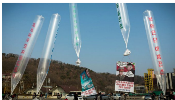
Fig. 3. Propaganda Balloon Drops Launched into North Korea by Human

emails indicate that Sony's South Korean division opted early on not to screen The Interview in South Korea, citing an aversion to its caricature of the leader of North Korea and spoof of a "North Korean" accent, South Korea's centrality as a site for a more sinister distribution of the film might give us some pause. 19 Much along the lines advocated by Bennett, organizations like the U.S.-based, right-wing Human Rights Foundation headed by the self-professed Venezuelan "freedom fighter" Thor Halvorssen Mendoza as well as South Korean defector groups asserted their readiness, even prior to Sony's temporary pulling of the film, to conduct illegal balloon drops of DVD copies of The Interview from South Korea into North Korea. We might note that one of the Korean subheadings on Sony's promotional poster for the film reads explicitly to a North Korean audience: "Don't believe these ignorant American jackasses." Of the film's propagandistic value, Halvorssen, who describes comedies as "hands down the most effective of counterrevolutionary devices"—here, echoing Rogen's cavalier assessment of the film's supposedly subversive potential, "Maybe the tapes will make their way to North Korea and start a fucking revolution"—told Newsweek , "Parody and satire is powerful. Ideas are what are going to win in North Korea. Ideas will bring down that regime." 20