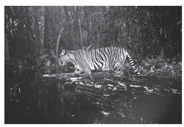
PLATE 1 An adult female tiger photo-trapped in inundated peatland in Kerumutan (Fig. 1).

stations in each block, in every other grid cell. This spacing assured at least three pairs of cameras in each tiger's home range, assuming a home range size of c. 50 km<sup>2</sup> in Sumatra (Franklin et al., 1999).