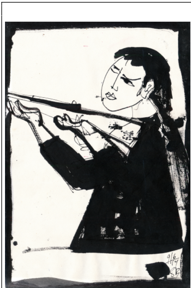
© 2017 - George Burchett, VC Girl , ink on paper, 9.6.14

This is what he wrote in his book, The Furtive War, the United States in Vietnam and Laos (1962) in a chapter titled War Against Trees :