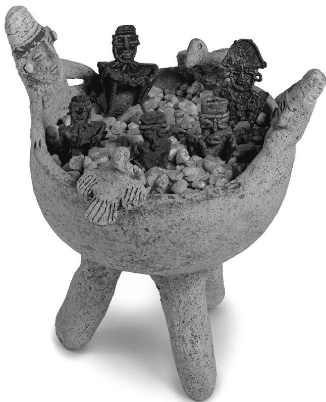
FIGURE 1.4 Tripod offering bowl with human and bird guardians, containing votive figures ( tunjos ) and emeralds, Colombia, Eastern Cordillera, 800–1600 CE (Muisca period). Los Angeles County Museum of Art, the Muñoz Kramer Collection, gift of Camilla Chandler Frost and Stephen and Claudia Muñoz-Kramer.

rag and wrapped cotton, all smoked', that was probably the object of all of these offerings. 163