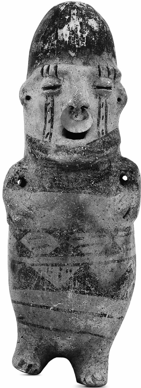
FIGURE 1.3 Ceramic figure with facial decoration and gold alloy nose ring ( santuario? ), Colombia, Eastern Cordillera, 800–1600 CE (Muisca period). Note the geometric design painted on the body of the figure, likely depicting a painted manta. Private collection.