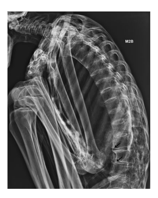
Figure 4. X-ray of the spine (lateral view): arrows indicate osteophytes and deformation of vertebral bodies caused by arthrosis.