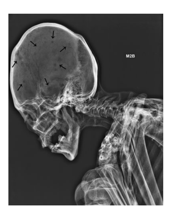
Figure 2. X-ray of the skull (lateral view): arrows indicate osteolytic areas without signs of peripheral sclerosis.

Radiographs are an important tool for the diagnosis of Coccidioides infections. A long-standing infection shows single or multifocal lytic, "punched-out" destructive lesions, with a loss of bone tissue and irregular borders (Blair 2007). However, X-rays with these features might also suggest other kinds of infectious and non-infectious processes. The vertebral involvement could be attributable primarily to tuberculosis (Wesselius et al. 1977), myeloma (Micarelli et al. 2019), or other fungal infections (Aufderheide and Rodriguez-Martin 1998; Bried and Galgiani 1986; Dalinka et al. 1971). Therefore, it can be difficult to distinguish among early stages of spinal mycotic infections.