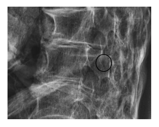
Figure 5. Lumbar tract: a lesion with a confluent circular profile and a thickened antero-inferior margin is visible on one of the posterior laminae of L3 as a hyper-diaphanous area (black circle).

myeloma is characterized by small uniform lesions that are spherical and that have irregular margins and no signs of osteoblastic activity. Usually, a diagnostic tool for identifying multiple myeloma is the presence of small lytic lesions on the skull. The destruction of the vertebral bodies often leads to the collapse of multiple vertebrae, resulting in kyphosis or scoliosis. However, these defects are spread throughout the skeleton and usually affect males older than 40 years old (Aufderheide and Rodriguez-Martin 1998). Given the age of the mummy, the distribution of lesions, and the absence of vertebral collapse, kyphosis, or scoliosis, multiple myeloma can be reasonably excluded as the lesions' causal agent.