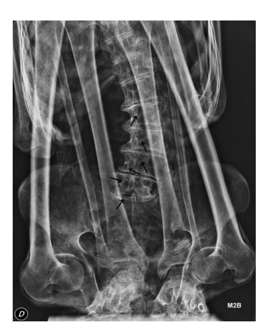
Figure 3. X-ray of the spine (frontal view): arrows indicate osteolytic lesions on the vertebral bodies of the lumbar tract.

We relied on the morphology and distribution of the lytic lesions found on the mummy, as well as geographic, ecological, biological, and clinical information, for the differential diagnosis. Multiple