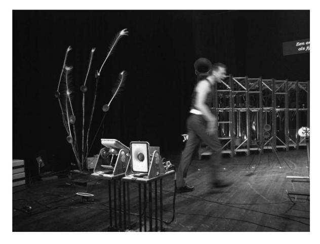
Figure 3. Speaker objects of Lautsprecher Arnolt on stage. Foreground: rotating loudspeakers.

and some video recordings (de Graaff 2016a). Nevertheless, a general lack of documentation is problematic for the preservation, re-performance and dissemination of her work. Problematic for preservation are: