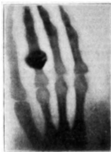
Figure 1 X-Ray image from Röntgen (1896, 276)

Röntgen's (or similar) experimentation will rest upon evidence gleaned from visual perceptual experience. Only the most skeptical of opponents would gainsay. (I am not claiming that we visually perceive X-rays.)