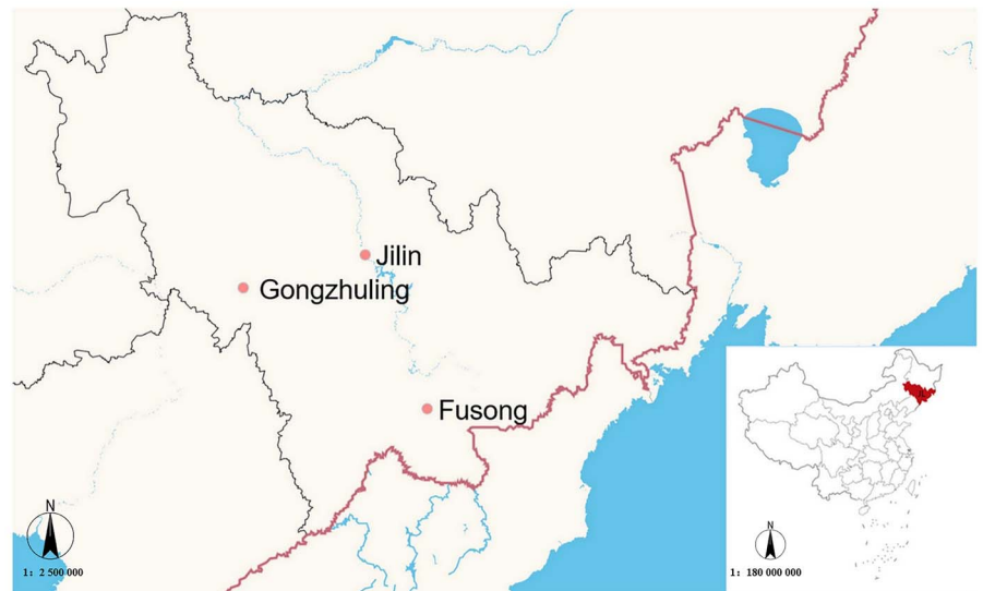
Figure 1. Map of China indicating the locality investigated in this study. The area marked in red represents the location of the investigated region.

The seroprevalence of Trichinella infections in pigs in north-eastern China was reported to vary from 0.02% to below 4% (Cui et al. , 2006; Liu and Boireau, 2002). With a confidence level of 95% ( z = 1.96 ) and an allowed deviation of the true prevalence of 5% ( d ), the projected seroprevalence is 4% ( P ). Consequently, 59 was used to calculate the sample size [according to n = P(1 - P)z^2/d^2 ] (Zhang et al. , 2015). Information regarding geographical position, age and sex is provided in Table 1.