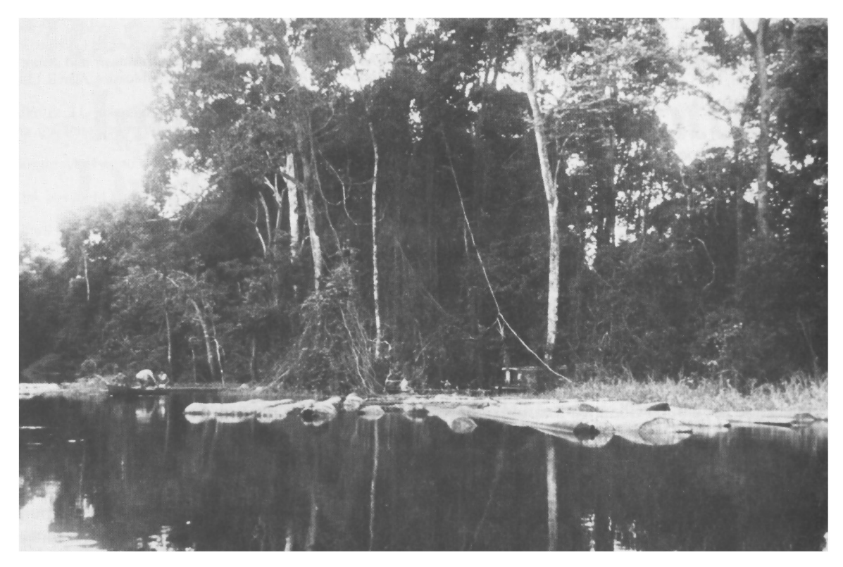
Logging camp in várzea close to Lake Teiú (J.M. Ayres).

the soil is better aerated and where the flooded period is short.