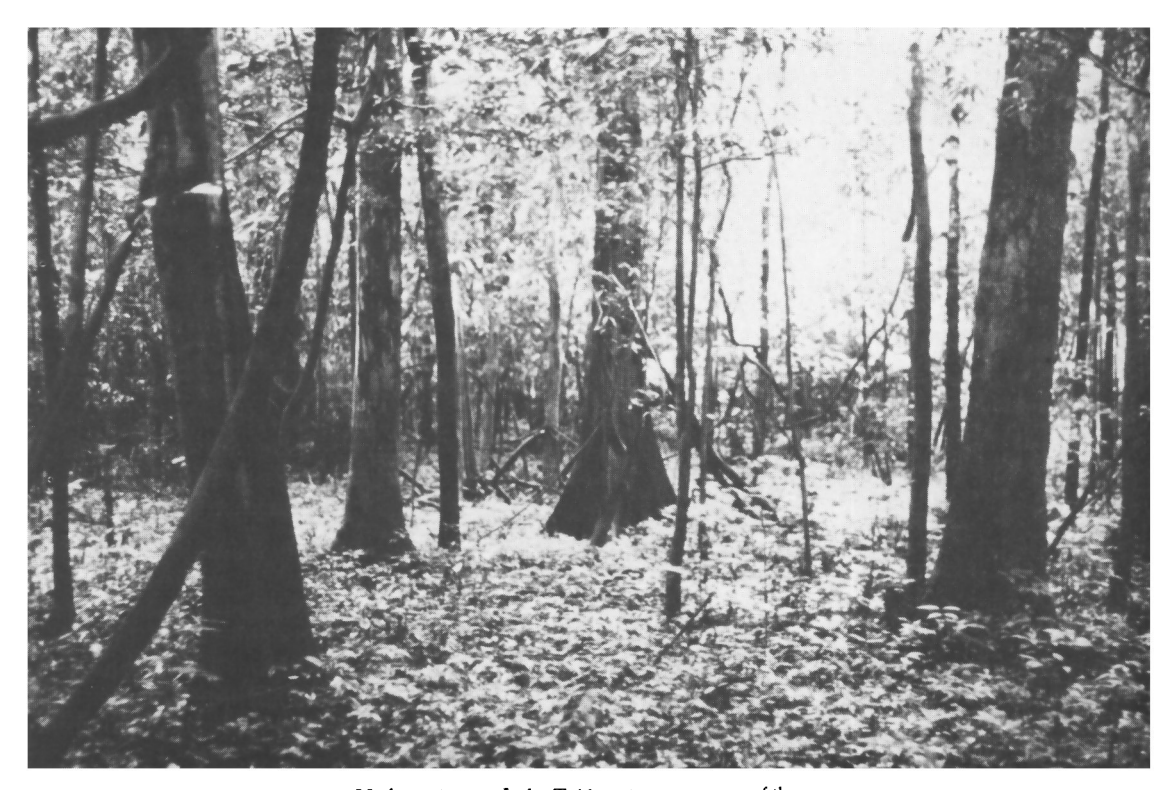
High restinga at Lake Teiú; note sparseness of the understorey.

1). One tree, Piranhea trifoliata, provides a vital food source at times of overall fruit shortage in the form of swarms of caterpillars of a species of noctuid moth. Loss of these trees would introduce a periodic critical food shortage, not only for uacaries but also for insectivorous birds, which also feed on the caterpillars, and for the frugivorous fishes, which eat the floating seeds of the tree (Goulding, 1980). It is a very common tree of várzea at present, but all large specimens of a tree can be removed very quickly (as shown by the almost complete eradication of Ceiba pentandra in one year, 1984, when it suddenly became commercially valuable).