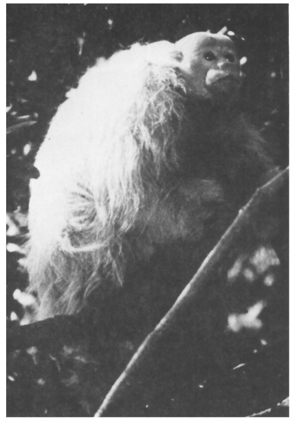
Adult male white uacari (L.C. Marigo).

(less than 20,000 years old) and only three other primates exist: the red howler Alouatta seniculus, the black-capped capuchin Cebus apella, and a squirrel monkey, either Saimiri vanzolinii or S. sciureus. All are generalists, feeding on a wide variety of foods. White uacaries are specialist frugivores feeding mainly on the seeds of unripe fruit, although they also eat mesocarps and arils of ripe fruit, nectar and a few insects. They are able to live in young várzeas, despite their specialized feeding habits, because of particular botanical characteristics of the restingus. Trees of the Brazil nut family (Lecythidaceae) and lianas of the family Hippocrateaceae appear very quickly and are abundant in restingas; both have large-seeded fruits, which form a major component of the uacaries' diet, and only they are able to open the tough seed cases. Fallen fruits and seeds are another important food source. and entire troops can sometimes be seen foraging on the ground (Ayres, 1987). In non-flooding 76