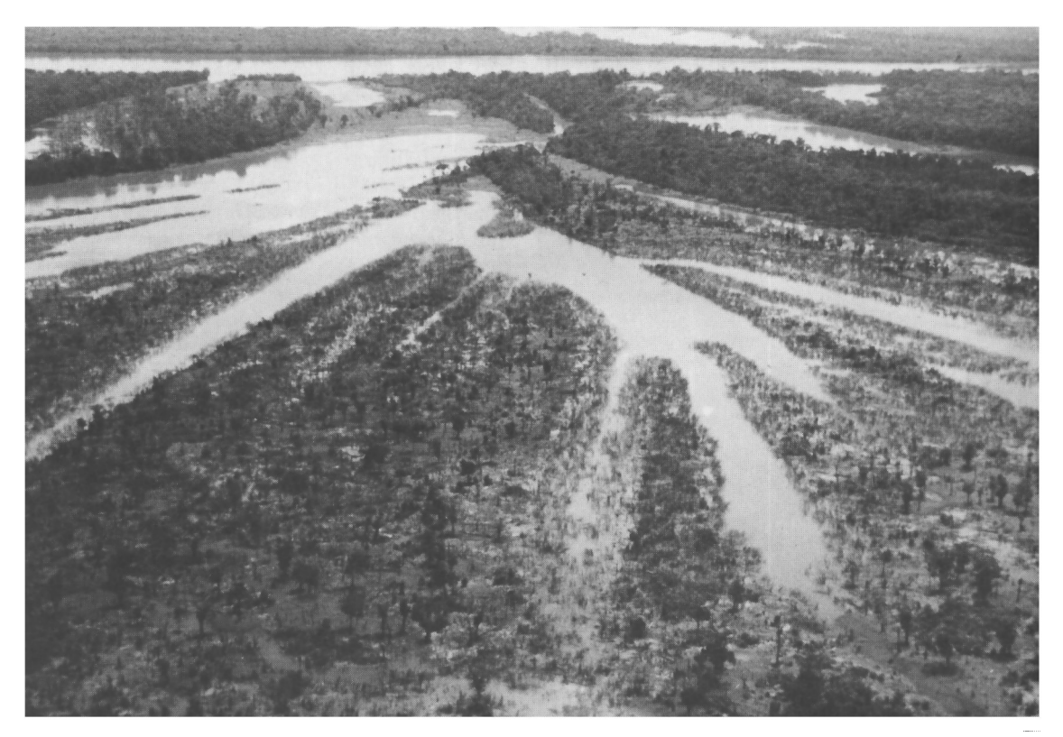
Aerial view of young várzea in the range of the white uacari; the water level is low, but still receding (R. Best).