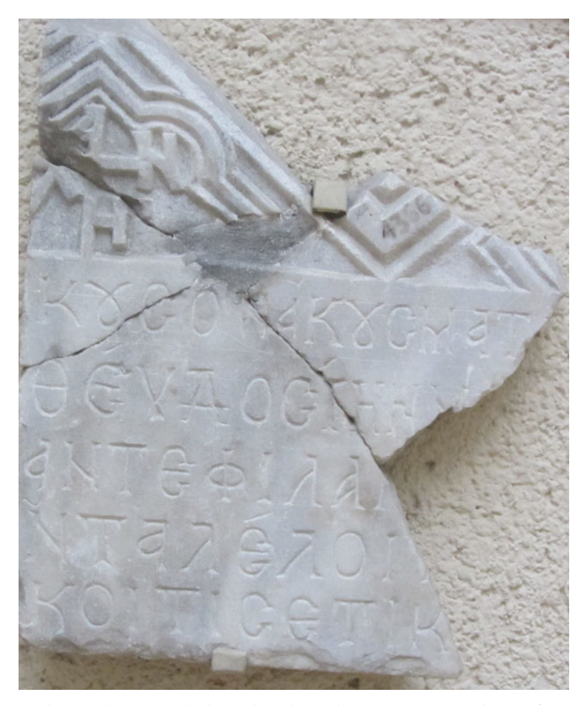
Figure 4. (Colour online) Istanbul, Archaeological Museum: sarcophagus fragment from Lips monastery with monogram of Angelos family.

Klaus-Peter Matschke has noted that there was no cult of imperial tombs in this period<sup>95</sup> and the evidence seems to confirm his remarks, although the importance of these tombs cannot be doubted. Imperial burials and funerals are frequently mentioned in the sources. It is true that the funerals of emperors attracted large crowds and were occasions for the populace of Constantinople to venerate and pay tribute to deceased rulers. In the case of Andronikos III, his corpse was placed in Hagia Sophia for public veneration; from there it was moved to the Hodegon monastery.<sup>96</sup> In his funeral oration for Manuel II, Bessarion reports that crowds took to the streets of the capital,