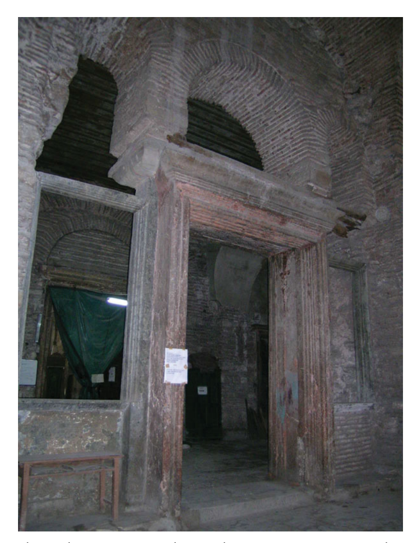
Figure 3. (Colour online) Constantinople, Pantokrator monastery: inner narthex, view from outer narthex of south church.

considerable importance for the ideology of the Palaiologan emperors. Curiously enough, however, the Komnenian tombs are not mentioned by any of the Late Byzantine visitors to the monastery, although the Russian pilgrims and the Castilian ambassadors clearly entered the middle chapel, as they describe the stone of the Unction, which was next to the tomb of Manuel I.<sup>74</sup>