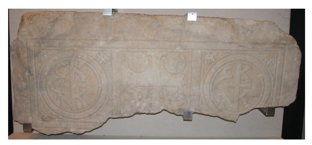
Figure 1. (Colour online) Mistras, Museum: sarcophagus fragment with monograms of Kantakouzenos and Palaiologos families.

Saint Sophia was also used for the burials of members of the Palaiologos family during the fifteenth century<sup>47</sup> and this later phase may have entailed alterations to the original Kantakouzenian mausoleum.<sup>48</sup> However, very little can be said until further material from the chapels is published. In any case, the single Palaiologan emperor who did not belong to the Palaiologos family was laid to rest far from the imperial capital, in a family mausoleum; a tomb within a dynastic monument of the ruling house of a semi-autonomous region was undoubtedly more prestigious than most tombs of other aristocratic families, but it was without aspirations to be an imperial burial.