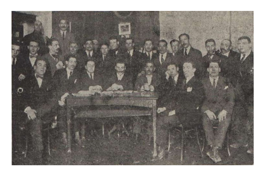
Figure 1. Meeting of the leaders of the Sindicatos Libres in Barcelona.

Carlism, which entered into what they considered unprincipled dealings with bourgeois liberalism. In 1907, Catalan Carlists joined an electoral bloc dominated by the liberal Regionalist League, which had close connections with Barcelona's industrialists. That generated much controversy among rank-and-file jaimistas , as Carlists were now often called.<sup>15</sup> The Jaimista Party held onto nineteenth-century elitist, demophobic visions of politics that incurred the impatience of its younger and more working-class members. A schism along generational and class lines loomed.