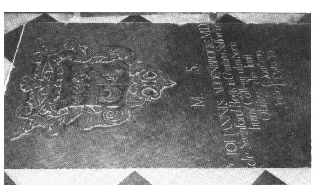
Figure 1. The tomb of John Addenbrooke in the Chapel of St. Catharine's College, Cambridge.