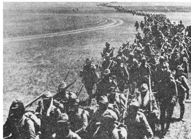
Japanese soldiers on the march, 1939.

on foot, and the primary mode of transportation for artillerymen and machine gun squadrons within infantry regiments was not car but horse. Even the transport corps, which was tasked with supplying food and ammunition, depended largely on transportation by horseback and horse-drawn carriage. When it came to movement and transport, the Japanese Army relied heavily on its foot soldiers and horses.