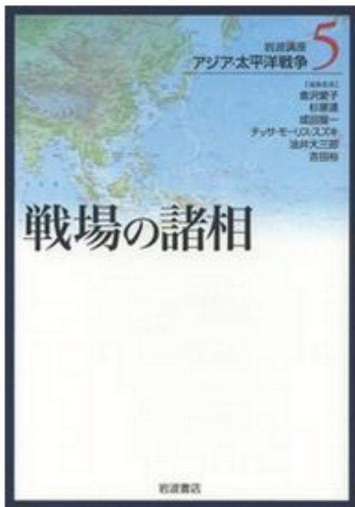
The edited volume containing Yoshida's article, published by Iwanami Shoten

Ajia-Taiheiyō sensō 5: senjō no shosō (2006)