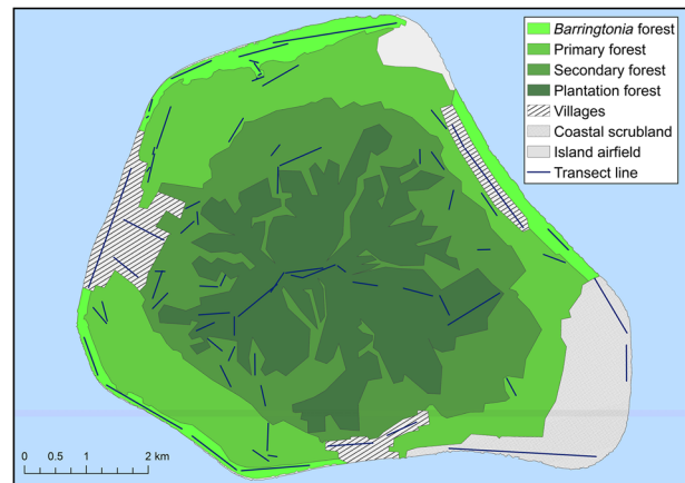
FIG. 2 Locations of the 73 transects surveyed across Mangaia during December 2018–February 2019. The area in the north-east of the island without any transects is where the airstrip is located; this was not considered a separate habitat type and was ignored for sampling purposes.

The common myna was estimated to have a population size of 13,350 individuals (95% CI 10,998–16,206; Table 1). The highest densities were in and around the villages and in the secondary forest, where the majority of individuals were found (Fig. 3). The coastal habitats supported fewer individuals than the inland habitat types, and the habitat with the lowest density of common myna was the plantation forest. The pooled CV for all habitat types was 9.8%; secondary forest had the smallest CV (11.7%) and coastal