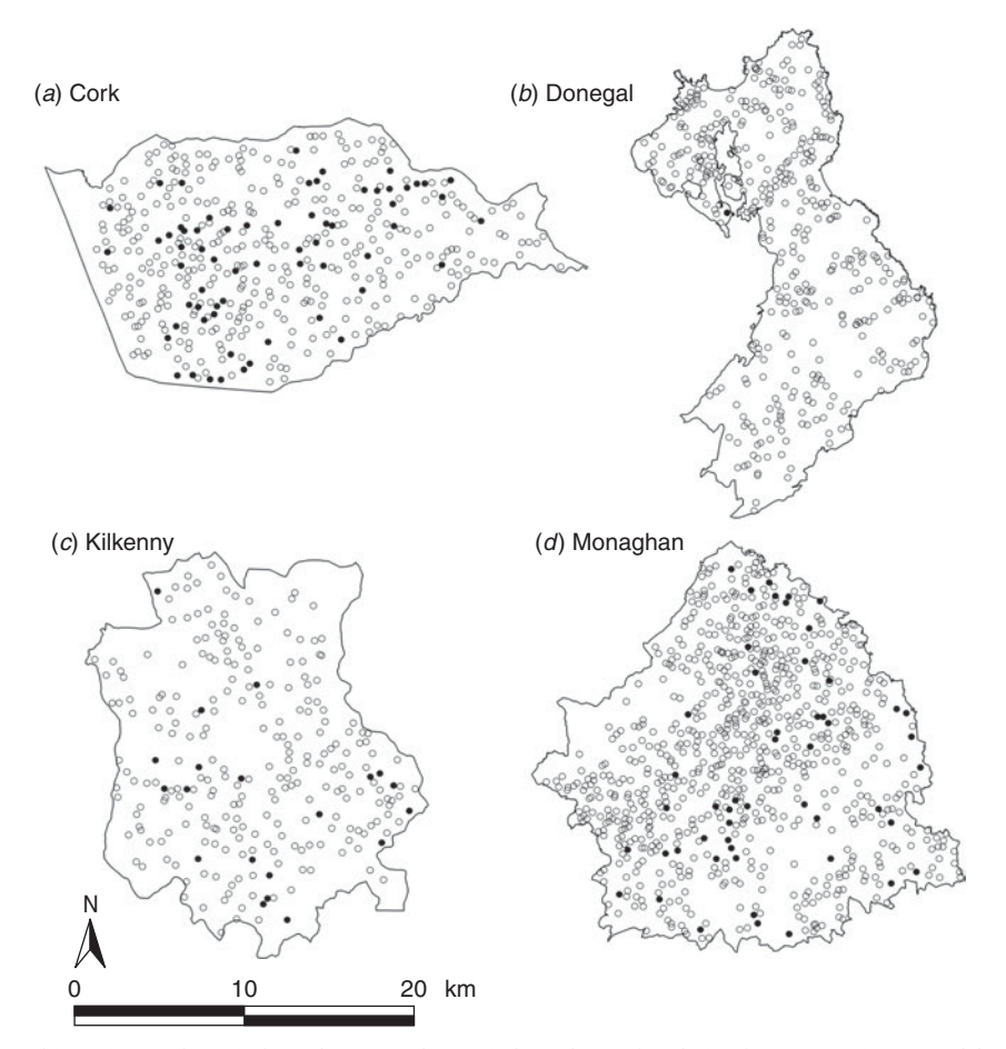
Fig. 2. Scatterplots of locations of TB infected ( \bullet ) and non-infected ( \bigcirc ) herds in the removal areas of four counties, in the period 1997–2002.

risk, after known influences have been accounted for. Thus, logistic regression models were fitted initially to the binary responses Y_i , i th herd infected/not-infected allowing fixed effects that explained all or part of the broad-scale (first-order) variation in the mean response to be identified. Semivariograms were then computed from the standardized Pearson residuals Z_i from the models, to identify the presence of residual spatial autocorrelation, i.e. second-order local spatial effects [20, section 6.3]. The semivariogram shows spatial dependence as a plot of semivariance vs. distance or lag h . The semivariance is calculated as