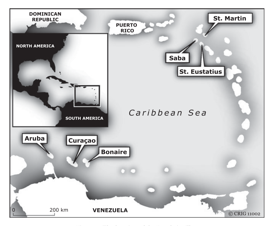
Figure 1. The location of the Dutch Antilles.

Dutch nationality (Sharpe 2005). On 1 January 2011, 141,345 Antilleans were living in the Netherlands, 5,345 of whom were aged 65 years and above (Centraal Bureau voor de Statistiek 2012).