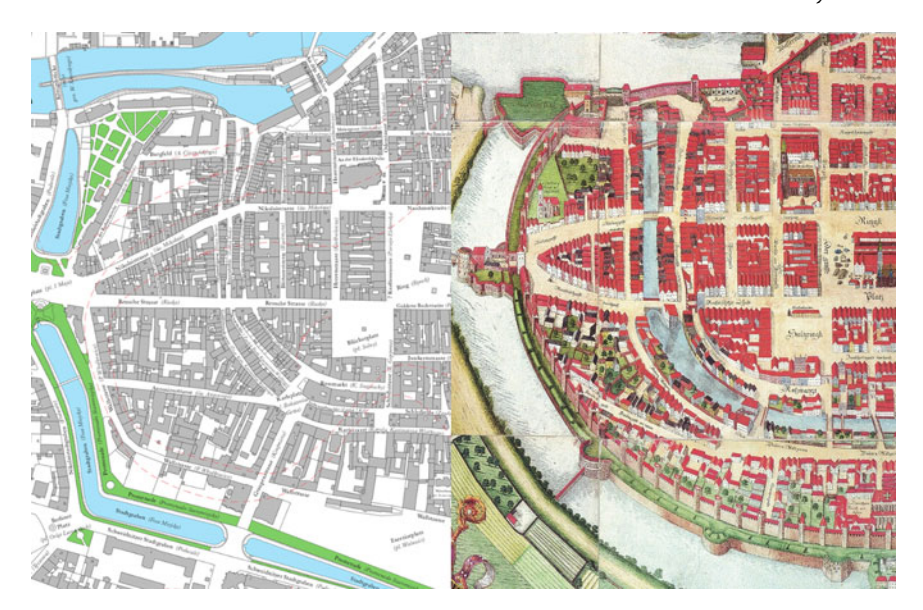
Figure 1. Comparison of cadastral plan from 1902–12 with view from 1562 (R. Eysymontt and M. Goliński (eds.), Historical Atlas of Polish Towns , vol. IV, 13: Wrocław (Wrocław, 2017), map 2; Barthel and Georg Weihner (1562), copy of J. Partsch (1826), <a href="https://commons.wikimedia.org/wiki/File:Breslau1562">https://commons.wikimedia.org/wiki/File:Breslau1562</a> Weihner.jpg, accessed 26 Mar. 2020).

structure of the medieval parts of the town. The inner city, around the market square, consists of densely built-up city blocks varying slightly in shape. The area on the peripheries (close to the external fortifications) is characterized by larger blocks with a looser structure. The view from 1572 depicts similar differences in the urban plan (Figure 1). M. Chorowska studied the process that led to these differences, <sup>39</sup> using archaeological data and metrological and architectural analyses of street blocks and tenements. The town's development started at the beginning of the thirteenth century, when the communal town (German Lokationsstadt, Grundungstadt) was established with a regular layout next to the early medieval settlement.<sup>40</sup> The oldest houses were concentrated around the market square, which was established during the first decades of the thirteenth century. Tenements behind that first ring of plots remained empty until they were inhabited during the first half of the thirteenth century. The areas directly adjacent to the first established town border were not occupied before the second half of the century. The process was repeated again after 1261 when lands located to the south and the west of the central core were incorporated into the town by surrounding them with the second fortification line. 41 The chronology of archaeological remains discovered in that newly enclosed area indicates that its development was even