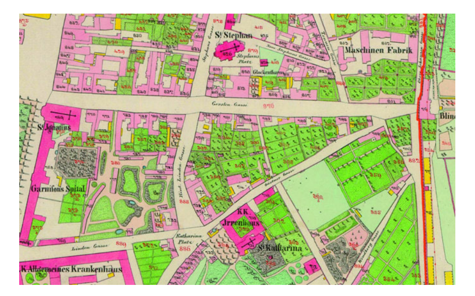
Figure 3. Prague New Town – a fragment of the imperial cadastral plan from 1842.

cleared of older settlements and farmlands. A new urban layout with large market squares was created in connection with the existing road network. Its whole area (360 ha) was surrounded by a defensive wall soon after the foundation. According to architectural and morphological analyses, initial development of the town took place around those squares and main streets, leaving large parts of the enclosed urban space unoccupied. In the southern part of the town, a few ecclesiastical institutions were established, receiving substantial quantities of land inside the town walls. This spatial structure seems to have been long lasting. A very accurate cadastral plan from 1842 (Imperial Stabile Cadastre), made before major changes in the urban layout, depicts substantial, irregular blocks of green spaces and large buildings located mostly in peripheral zones, close to the town walls (Figure 3). The green spaces might be interpreted as gardens, some of which originated after the partial destruction of the town during the Swedish siege of 1648. Others were, however, much older, being mentioned in the written records in the late Middle Ages.