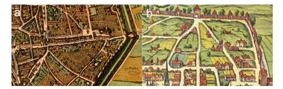
Figure 5. Fragments of the town views from Braun and Hogenberg, Civitatis orbis terranum . (a) – Cologne 1572; (b) – Visby 1598.

fabric.<sup>62</sup> Similarly, town councils tried to keep the area within the walls fully developed by ordering owners of plots to build a house within a certain time after acquiring the land and then to maintain it properly.<sup>63</sup> In Wrocław, in 1506, even the bishop was ordered to rebuild his property under the threat that his plot would be repossessed by the town council.<sup>64</sup>