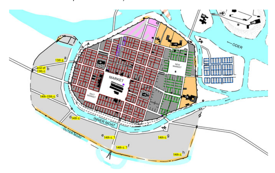
Figure 2. Wrocław - central urban layout from the thirteenth century and chronology of archaeological remains in the area incorporated in 1261. (a) Mikołajska 25-6 (P. Janczewski, 'Zmiany zagospodarowania przestrzeni dawnej działki mieszczańskiej przy ul. św. Mikołaja 25-26 we Wrocławiu', Śląskie Sprawozdania Archeologiczne, 44 (2002), 301-13); (b) - Św. Mikołaja 48 (C. Lasota, J. Piekalski and I. Wysocki, 'Działki mieszczańskie przy ul. Św. Mikołaja 47/48 i 51/52 na Starym Mieście we Wrocławiu', Śląskie Sprawozdania Archeologiczne, 43 (2001), 345-64); (c) - Św. Antoniego (C. Buśko and J. Piekalski, 'Stratygrafia nawarstwień w obrębie ulicy Św. Antoniego we Wrocławiu', Śląskie Sprawozdania Archeologiczne, 37 (1996), 243-53); (d) - Kazimierza Wielkiego 27a (C. Buśko and J. Niegoda, 'Badania archeologicznoarchitektoniczne przy ul. Kazimierza Wielkiego 27A we Wrocławiu', Śląskie Sprawozdania Archeologiczne, 43 (2001), 577-83); (e) - Świdnicka 21/23 (L. Berduła, 'Wyniki badań architektoniczno-archeologicznych we Wrocławiu przy ul. Świdnickiej 21/23', Silesia Antiqua, 36/7 (1994), 77-94); (f) - Widok (J. Piekalski, 'Z badań zewnętrznej strefy Starego Miasta we Wrocławiu, Plac Teatralny i ul. Widok', Śląskie Sprawozdania Archeologiczne, 41 (1999), 307-24); (g) - Wierzbowa 2-4 (P. Konczewski, Działki mieszczańskie w południowo-wschodniej części średniowiecznego i wczesnonowożytnego Wrocławia (Wrocław, 2007)); (h) -Nowa 2a (J. Romanow, 'Wyniki badań archeologiczno-architektonicznych prowadzonych w latach 1998 i 2000 na terenie posesji 2a przy ulicy Nowej we Wrocławiu', excavations report in archive of The Voivodeship Conservator of Historical Monuments in Wrocław) (plan based on M. Chorowska, C. Lasota, T. Kastek and J. Połamarczuk, 'Map 5 Wrocław around 1300', in R. Eysymontt and M. Goliński (eds.), Historical Atlas of Polish Towns, vol. IV, 13: Wrocław (Wrocław, 2017), modified by authors).

slower, with some spaces remaining empty for a longer time. The oldest artefacts on particular sites are post-thirteenth century (Figure 2). The existence of 'empty' space for building reserves probably resulted in the different layout of the outer parts of the town, characterized by irregular urban blocks and the presence of tenements and houses with gardens in the later period.