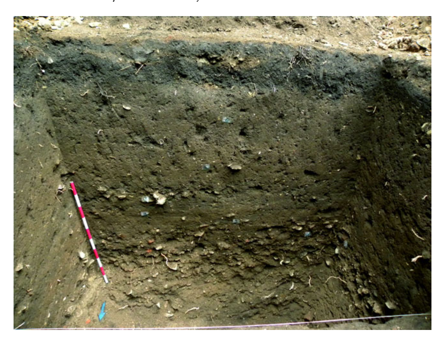
Figure 7. Prague New Town - 'garden layer', Opatovická Street no. 160.

converted and used as gardens (often with added utility structures and buildings), much to the annoyance of the town council.<sup>77</sup>