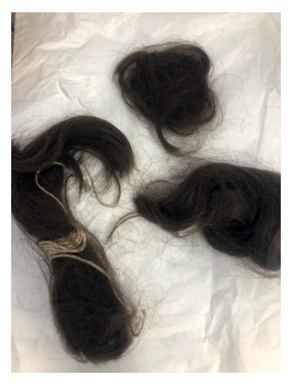
Figure 8 Female Hair forcibly removed during an 'Outrage' in the Irish Civil War, courtesy of the National Museum of Ireland Ireland and the Kevin Barry Family.

rather than extensive narrative exposition. Lowe recalls, 'It's also sad to read of the attempts the women made to protect themselves, even later in giving statements. They had no words for what happened to them physically; the language could be very reticent' (qtd in Irish Times , 2022). This point is further examined by McAuliffe, noting, '... anti treaty women were often arrested and held for days in local barracks where they suffered what they referred to as indignities. This obtuse language covers what were sometimes serious physical and sexual assaults. The later military pension application files of many these women indicate that their mental, physical and/or emotional health was seriously, sometimes permanently damaged by these experiences' ( The Wakefires Programme Note, 2022).