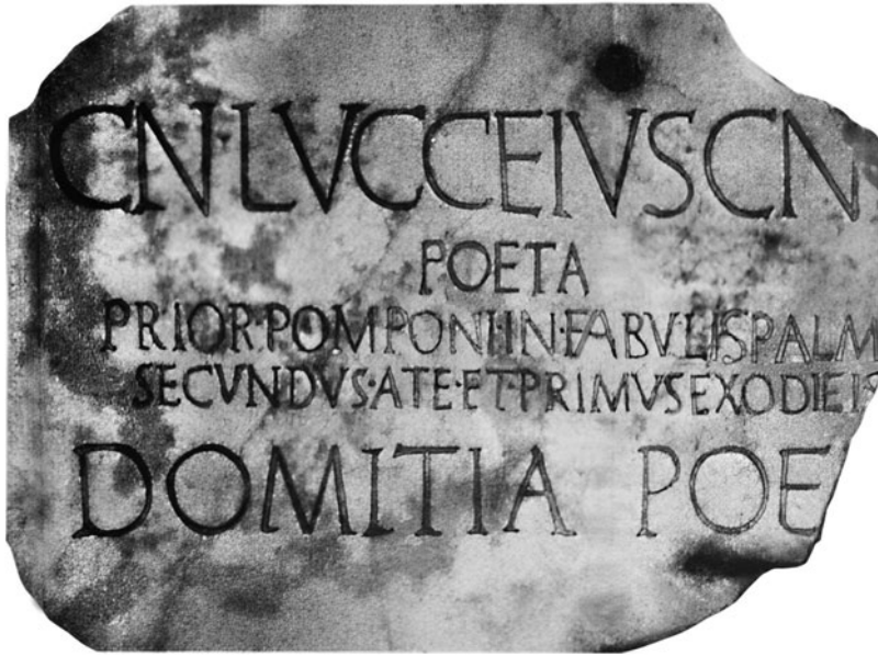
Fig. 6. Inscription of Cn. Lucceius (from Puglia, n. 54).

Cn(aeus) Lucceius Cn(aei) f(ilius) [- - - ?] poeta [[- - -]] prior Pomponi in fabulis palm[- - -] secundus a te et primus exodiis 5 Domitia poet[ae - - - ?]