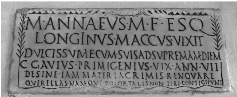
FIG. 3. Epitaph of the Maccus M. Annaeus Longinus.

Apart from the term Atellanus , Atellana actors could also be referred to by the character that they usually played. Some inscriptions also attest to this habit, although a cautious approach is again needed. The most relevant inscription is another marble slab, dated to the first century A.D., discovered in the catacombs of SS Gordianus and Epimachus in Rome, where it had been reused, and now set in the walls of the portico of Santa Maria in Trastevere ( CIL 6.10105 = ILS 5219 = CLE 823 = EDR 108850; see fig. 3 ). 38