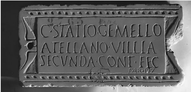
FIG. 1. Inscription of C. Statio Gemellus

C(aio) Statio Gemello Atellano Villia Secunda cont(ubernali) fec(it).