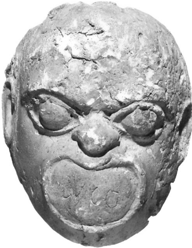
FIG. 4. Bucco mask with didascalical inscription on its mouth.

may attest to the continuity of Atellan farces in Pompeii in the first century A.D., which is not surprising given its Oscan origins and its close proximity to the city of Atella.