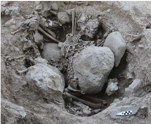
Figure 5. An adult female among large stones; metric scale: 10cm (photograph credit: Uğurlu Archive).