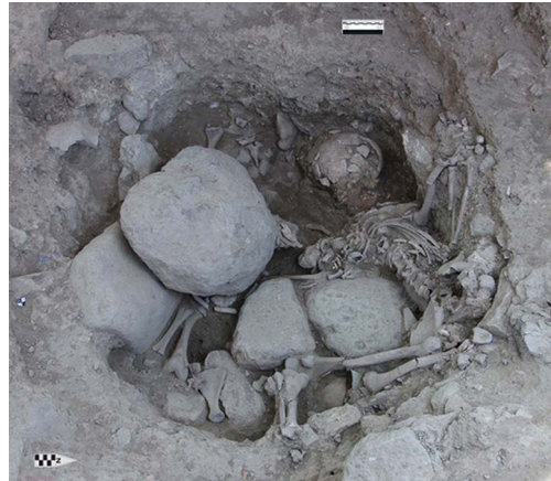
Figure 6. An adult female and animal bones at the lower layer of the burial pit; metric scale: 10cm.

The burial pit was found in the courtyard of the communal building. It measures approximately 1 \times 1.2 m across and about 1.5 m in depth. Although the excavation of the pit is not yet complete (at least two individuals are still in the ground), 10 skeletons have been lifted and studied in detail using the technique developed by Buikstra and Ubalaker (1994) (Figures 3–6). All age groups and both sexes are represented, including a three-year-old child and adult males and females (Table 1). Two AMS dates from the stratigraphically highest and lowest skeletons so far removed yield a result around 5300 cal BC (Table 2). These remains were concurrent with the communal building. All skeletons, except one (skeleton 6), were fully