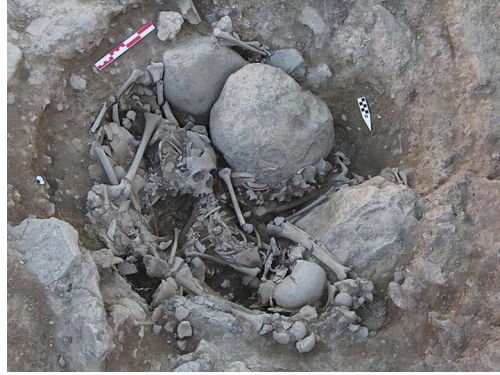
Figure 4. Intertwined burials and large stones; metric scale: 10cm.