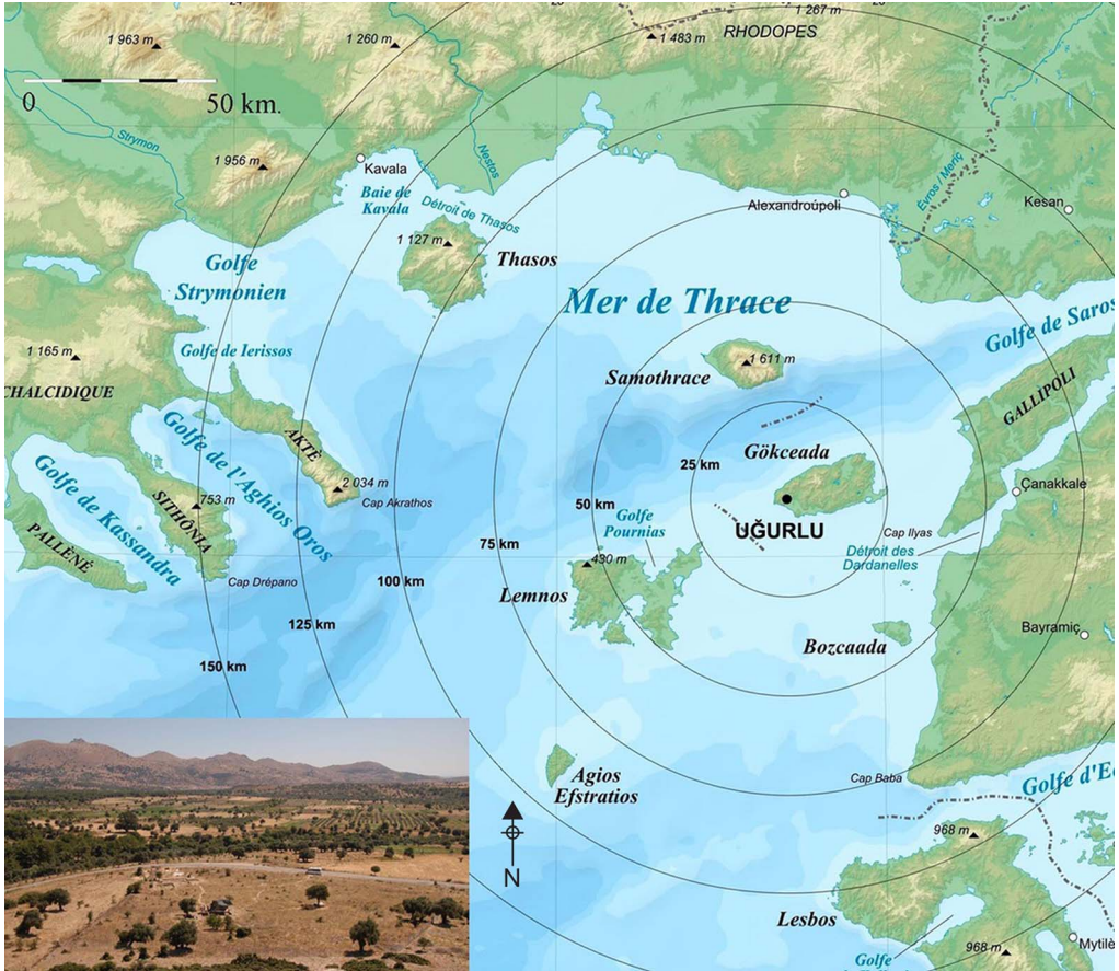
Figure 1. Location of Uğurlu in the North-eastern Aegean.