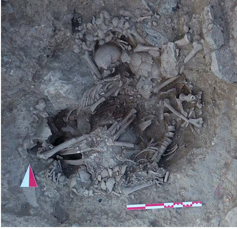
Figure 3. Adults and adolescents from the top layer of the burial pit; metric scale: 10cm.