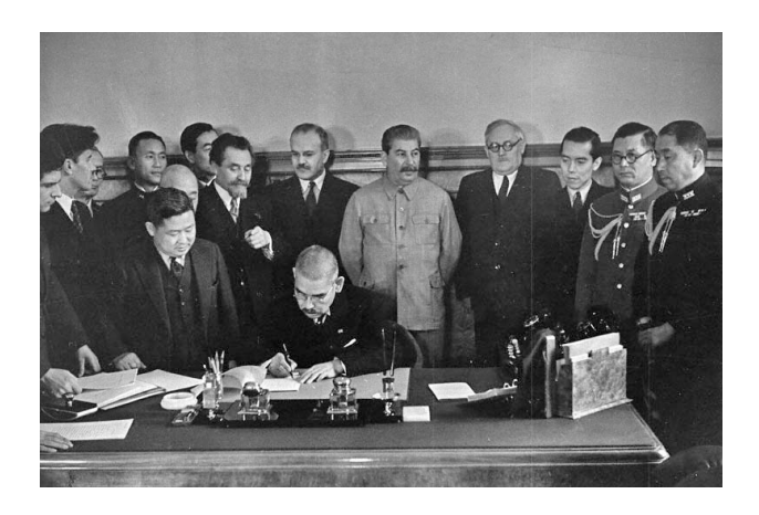
Figure 4: Kase Toshikazu (third on the right) at the conclusion of the Soviet-Japanese Neutrality Pact, Moscow, 13 April 1941.

Matsuoka signed the Tripartite Pact with Germany and Italy in September 1940, and the Soviet-Japanese Neutrality Pact in April 1941; see Figure 3]. At that time, no one dreamed that Hitler would invade Russia. From Japan's point of view, the invasion was a betrayal' [which harmed Japan's fragile trust of Germany].