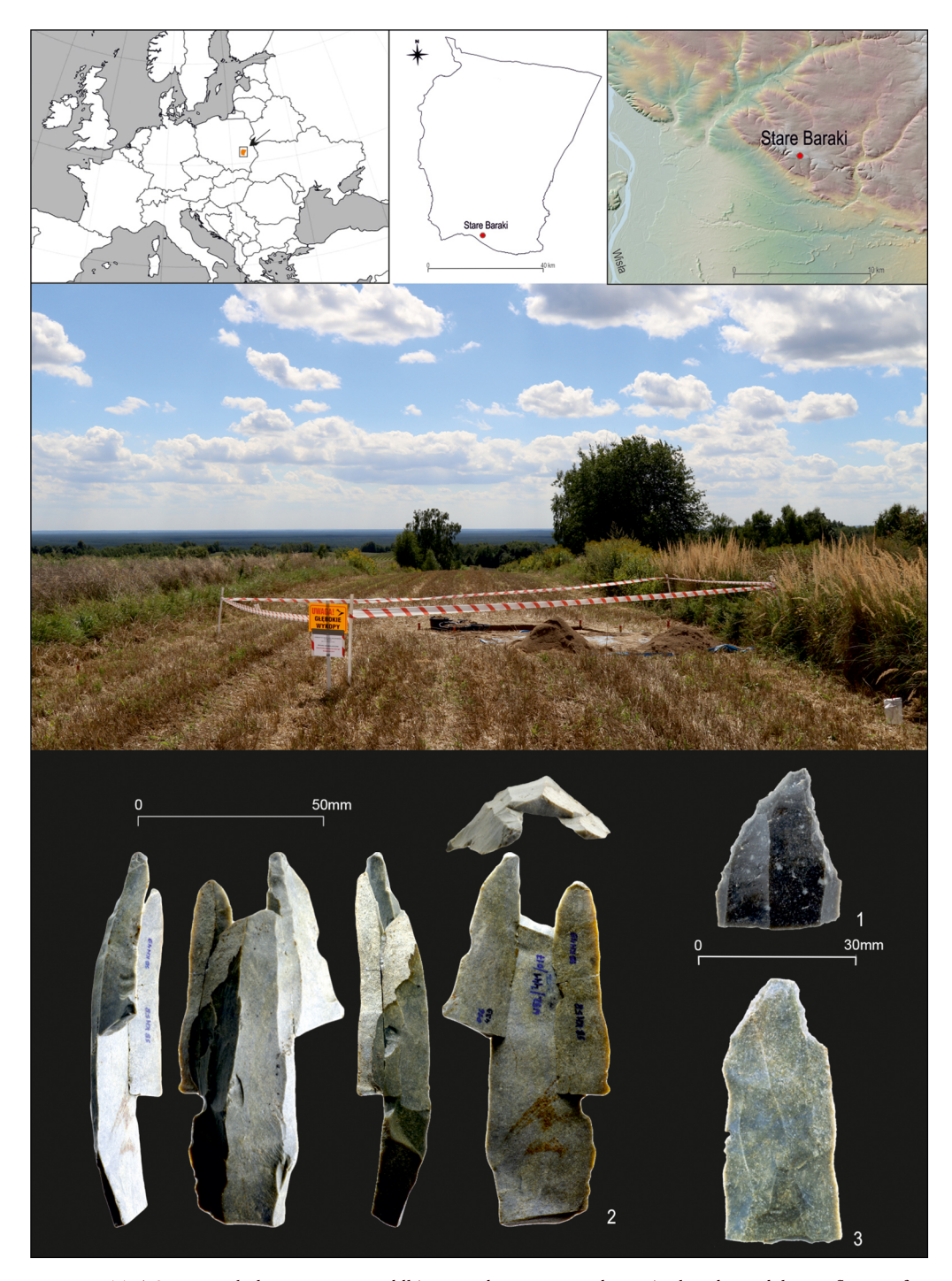
Figure 2. Top) Stare Baraki location map; middle) site under excavation; bottom) selected Magdalenian flint artefacts (photographs by T. Wisniewski, based on a map from geoportal.gov.pl).