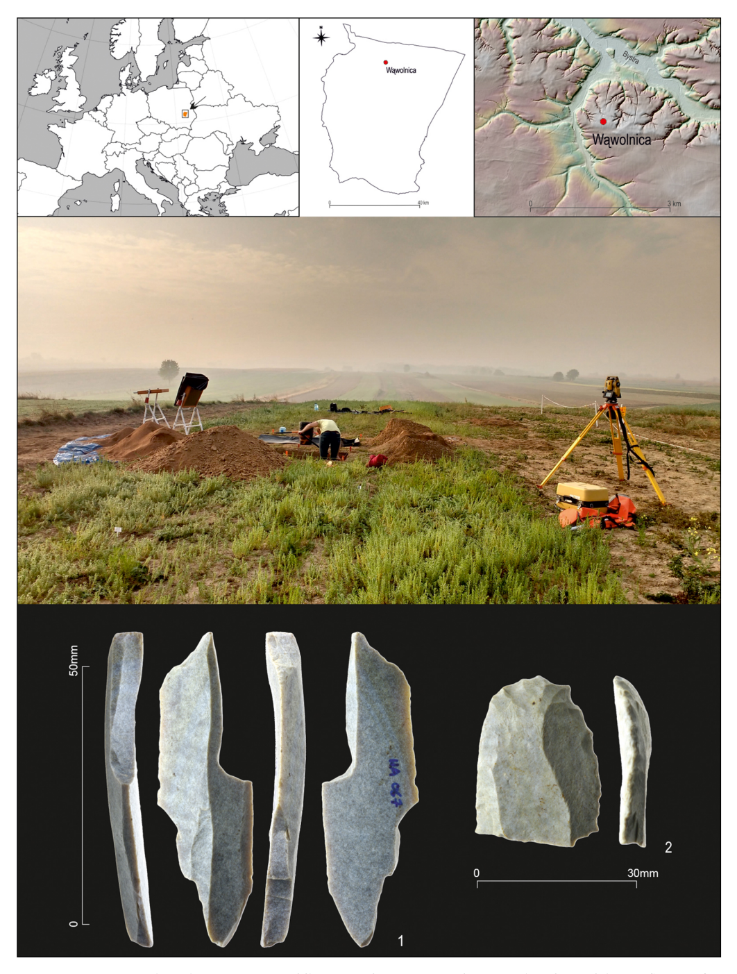
Figure 3. Top) Wawolnica location map; middle) site under excavation; bottom) selected Magdalenian flint artefacts (photographs by T. Wisniewski, based on a map from geoportal.gov.pl).