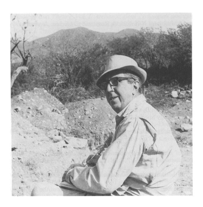
IGNACIO BERNAL <sup>1</sup> 1910–1992

A great tree has fallen in the mesoamerican forest, and it is unlikely that the hole in the canopy will be filled in the foreseeable future. Ignacio Bernal, one of the giants of Mexican archaeology and the world's leading authority on ancient Oaxaca, died on January 24, 1992, at the age of 81.